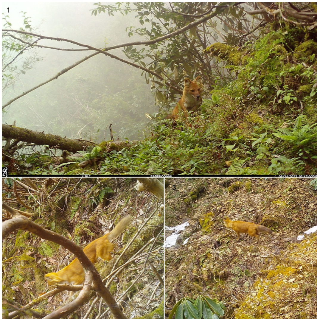
Image 2. Solitary Dhole photographed two locations at Barun Valley: 1—Bharyang Khola at 1547 h on 24 August 2022 and Bagare | 2–3—on March 2022 & 24 August 2022 at 1547 h.