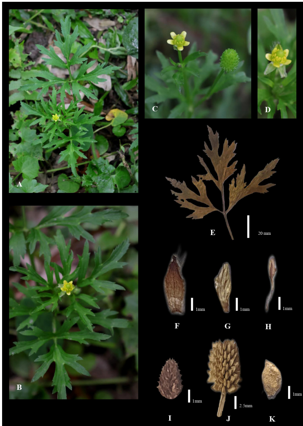
Image 1. Ranunculus cantoniensis DC.: A–B—Habit and habitat | C—Branch with flower and maturing fruit | D—Flower | E—Portion of leaf | F—Sepal | G—Petal | H—Stamen | I—Gynoecium | J—Etaerio of achenes | K—A single achene.

or minutely granular, 3.5–4 x 2–3 mm. Seeds ovoid, flattened, light brown, 2 x 1 mm; apex rounded; base acute; hilum lateral, black.