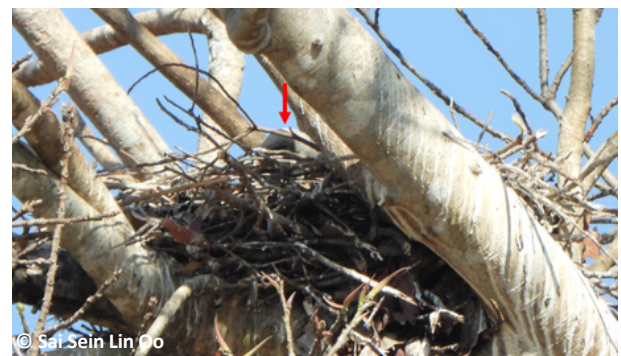
Image 3. A head of nestling visible in the nest in Nam Linn on 5 February 2023.

a substantial cattle population in the region, as has been found in southern India (Manigandan et al. 2023).