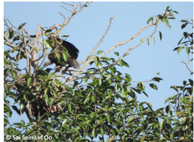
Image 2. A crow on the nest of White-rumped Vulture on 5 February 2023 in Kone Mont Village.

With this survey, we documented the breeding success of the 'Critically Endangered' White-rumped Vulture in Myanmar's Shan Highlands, representing the first confirmed breeding record in the eastern part of the country. It also sheds light on their nesting site preferences and food availability. Between November 2022 and March 2023, we observed nestlings in six nests, and all six nestlings successfully fledged. This is a positive sign for vulture conservation in Myanmar (Hla et al. 2011). Our findings suggest that these vultures have sufficient food sources in the study areas, as evidenced by frequent observations of vulture flocks and recorded carcasses. The availability of food is crucial for vulture presence, especially considering their role as obligate scavengers. This is further supported by the presence of