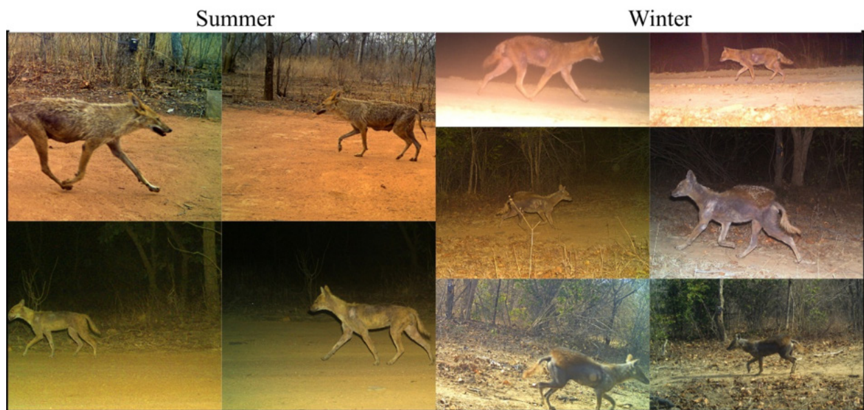
Image 1. Images of mange-infested Golden Jackal during the camera trap sampling in 2019 in Panna Tiger Reserve, central India.

Park in January 2007. Mange-infested animal death is common (Wydeven et al. 2003; Smith & Almborg 2007) and can spread quickly in the population (Almborg et al. 2012). Therefore, identification of affected individuals is necessary and proper treatment should be provided (Rowe et al. 2019). Mange-infested jackal has the potential to infect other jackals and other species through direct and indirect contact (Alasaad et al. 2012; Valldeperes et al. 2021). Affected individuals are genetically compromised, which may lead to severe detrimental effects in population level (DeCandia et al. 2021). Since transmission may occur from human to domestic animals or domestic to wild animals; thus, the 'One Health' approach should be executed to monitor human-domestic-wildlife health (Lerner & Berg 2015; Mackenzie & Jeggo 2019).