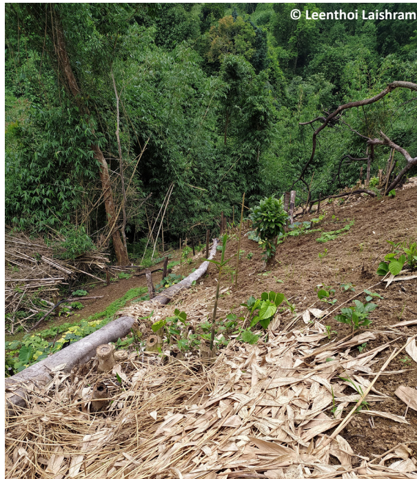
Image 2. Habitat of Vandeleuria oleracea at Rongtara.

proximity to secondary bamboo forests. This species is arboreal and exhibits nocturnal behavior, primarily consuming fruits, buds, and flowers.