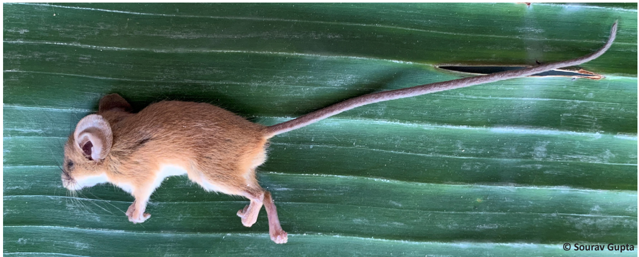
Image 1. Dead Vandeleuria oleracea at Rongtara.