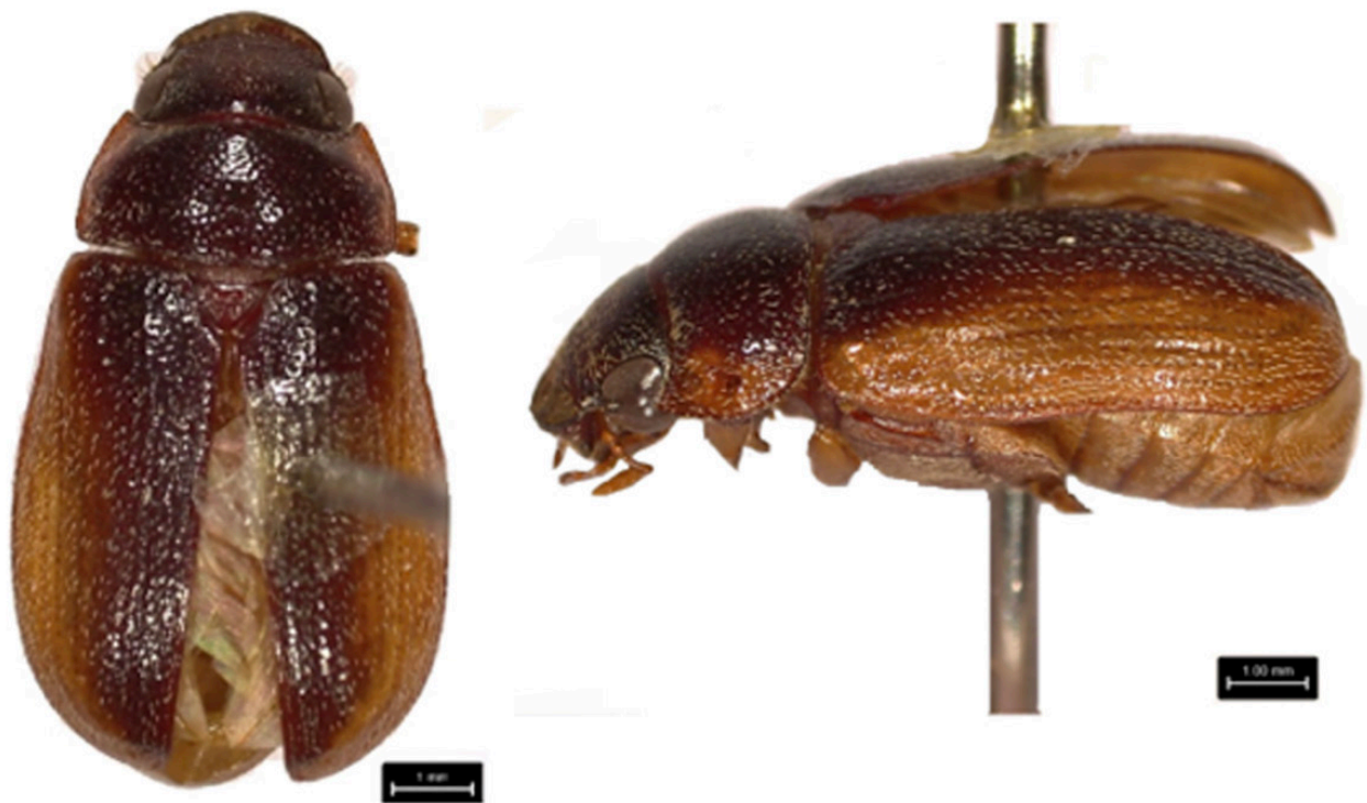
Image 1. Adult female of Adoretus kanarensis Arrow, 1917.