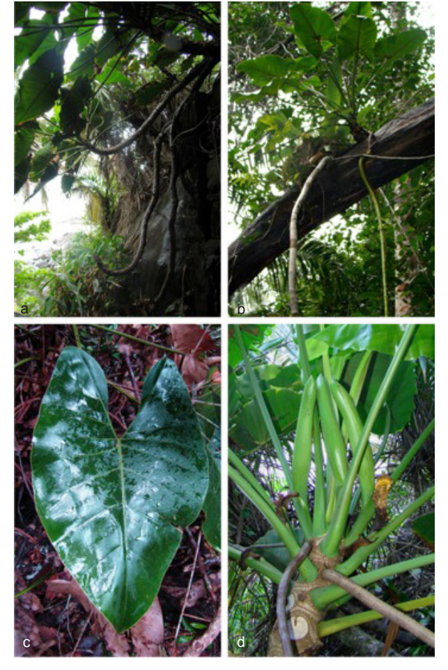
Image 1. Philodendron williamsii Hook f. a - Rupiculous population (Calazans & Morais 54); b Hemi-epiphyte individual with storied cork recently taken (Itacaré, not collected); c - Leaf blade (Calazans et al. 139); d - Inflorescence in full bloom. (Calazans et al. 155).

There is a remarkable population growing on granitic outcrops rocks at Itacaré beach, a few meters from the sea (Image 1a&d). This same population