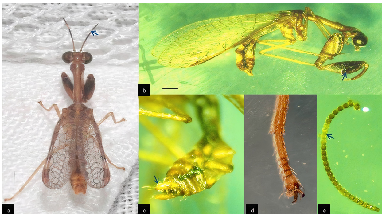
Image 2. Photographic images of male Mantispa indica (a–e): a—General habitus from the dorsal | b—General habitus from lateral (femur inside darker) | c—pointing out Gonocoxite | e—lighter region of antenna segments. Scale bar = 1.0 mm.