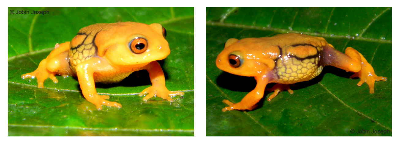
Images 4 and 5. Raorchestes resplendens at Poovar, Eravikulam National Park, May 2012