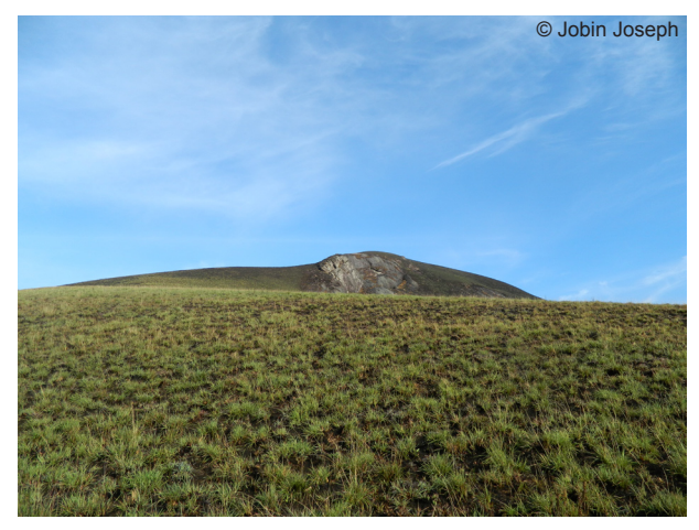
Image 3. The view of the habitat of Raorchestes resplendens at Poovar, Eravikulam National Park

Journal of Threatened Taxa | www.threatenedtaxa.org | September 2012 | 4(11): 3082-3084