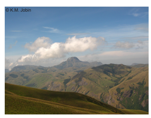
Image 2. The view of Anamudi peak, from the Poovar, in Eravikulam National Park

Raorchestes resplendens is a brightly coloured frog (Images 4 & 5), with reddish-orange upper side, including the dorsal parts of limbs, fingers and toes. The groin and inner side of the thighs are black, ventral