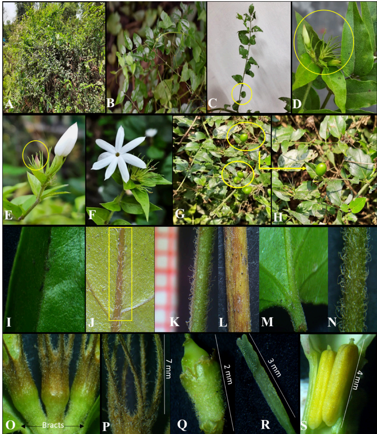
Image 1. Jasminum angustifolium (L.) Willd. var. angustifolium : A—Habit | B—Plant in vegetative condition | C—A leafy twig showing variations in leaf shape | D—Terminal inflorescence containing three diagnostic calyx and pink tinge bud | E—White bud with pink tinge on young shoot | F—Open flower | G—Single and paired fruit | H—Fruit with magnified view | I—Glabrous lamina surface (except midrib) | J—hairs along the midrib | K—Young shoot hairs | L—Magnified view of a matured, glabrous branch | M—Puberulent petiole | N—Magnified view of petiole hairs | O—Persistent calyx | P—Hairy sepals | Q—Ovary | R—Bifid stigma | S—Apiculate anthers.

division, Jalpaiguri, West Bengal, K. Modak & M. Chowdhury NBU 11773, NBU 12638, NBU 12640, NBU 12641.