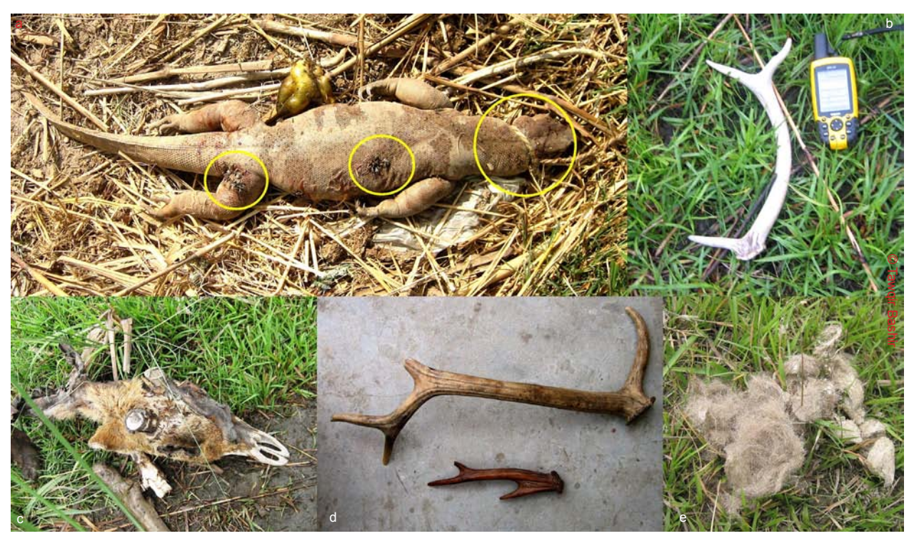
Image 1. (a) Monitor Lizard carcas with deadly wounds; (b) Swamp Deer antler; (c) Swamp Deer carcas with cut antlers; (d) Swamp and Hog deer antlers recovered; (e) Fishing Cat scat