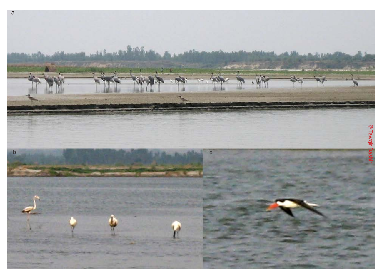
Image 2. (a) Sarus Cranes; (b) Greater Flamingo and Eurasian Spoon Bill; (c) Indian Skimmer Journal of Threatened Taxa | www.threatenedtaxa.org | August 2012 | 4(9): 2900–2910