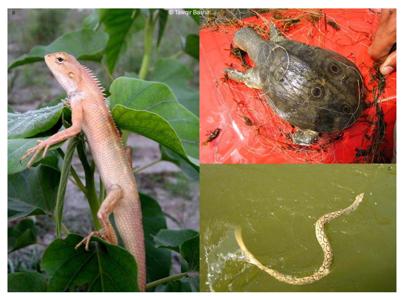
Image 3. (a) Common Calotes; (b) Peacock Softshell Turtle entangled in fishing net; (c) Russell's Viper

species in the stretch as reported earlier (Behera 1995; 2002), signifying it as a potential habitat in the upper Ganges for dolphin and turtle conservation (Behera 1995; Behera & Rao 1999; Behera 2002). Occurrence of a major proportion of water birds is also an indicator of good habitat quality. Majority of mammal, bird and reptile species occurrences in agricultural fields, forest patches along banks and in marshlands symbolises that not only the river stretch but its banks are equally rich in biodiversity representing a rich riverine ecosystem, but with few concerns; since agricultural activities are continuing to increase along the banks (Bashir et al. 2010a) and additionally some threats to riverine biodiversity were identified at local level in this study. Increasing agricultural activities and percentage of cultivated land of riparian wetlands have been suggested to affect bird communities by decreasing species diversity (Mensing et al. 1998). Despite survey constraints, there is a regular need to assess the level of biodiversity and health of this river