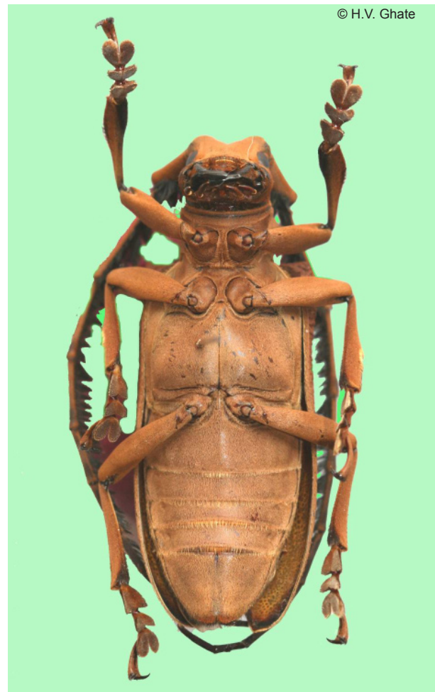
Image 2. Sarothrocer a lowii White, ventral view

longer than broad; elytra elongated, convex, rounded at the apex; prosternal process short, feebly elevated; legs moderately long, very robust; protibiae flattened, metatibiae with a dorsal furrow, claws divaricated..” .