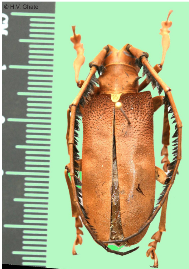
Image 1. Sarothrocer a lowii White, dorsal view of female