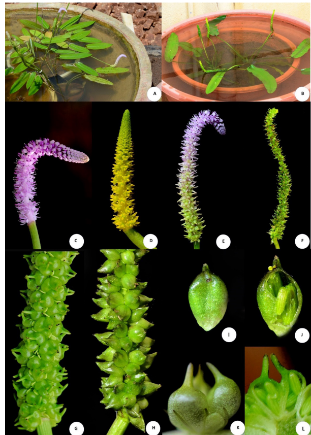
Image 4. Aponogeton natans : A—Habit | B—Habit | C & E—Inflorescence | G—Enlarged portion of infructescence | H—Mature fruit | I—L.S. of fruit showing seeds. A. lakhonensis : B—Habit | D & F—Inflorescence | H—Enlarged portion of infructescence | I—Mature fruit | J—L.S. of fruit showing seeds. © S.R. Yadav.

image!); Jaboka, Sivasagar district, Assam, 1898, M.A. Hock, CAL499690, image!; Poba Reserve Forest, Jonai, Dhemaji district, Assam, 132m, 13.iii.2021, 27.811N, 95.302E, D. Dey, DDM03 (GUBH!), (ASSAM!).