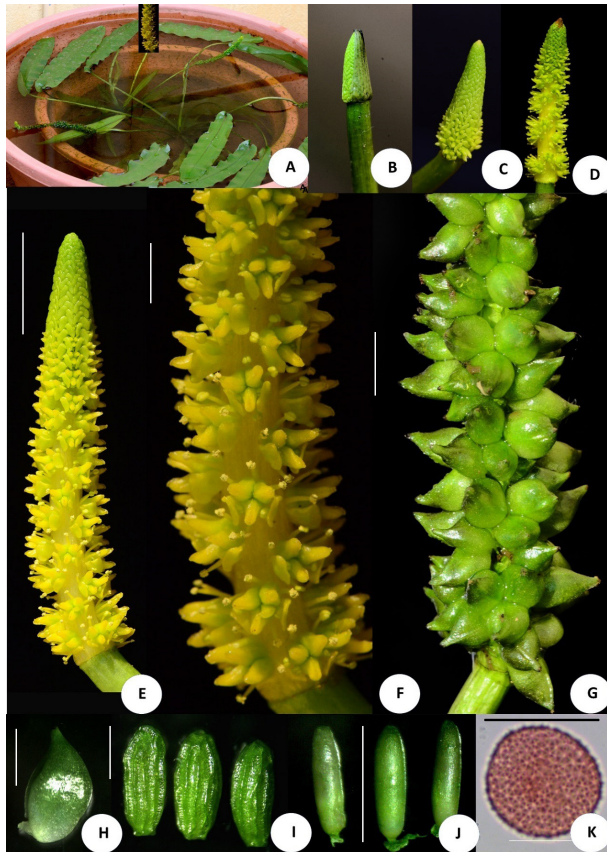
Image 3. Aponogeton lakhonensis : A—Habit | B—E—Inflorescences in different stages (Scale 0.9 cm) | F—Enlarged portion of inflorescence (Scale 0.24 cm) | G—Enlarged portion of infructescence (Scale 0.6 cm) | H—Mature fruit (Scale 0.3 cm) | I—Seeds (Scale 0.2 cm) | J—Embryo with inner integument (Scale 0.3 cm) | K—Pollen grain (Scale 20 µm).