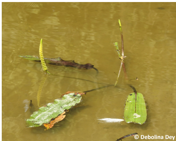
Image 1. Habit of Aponogeton lakhonensis .