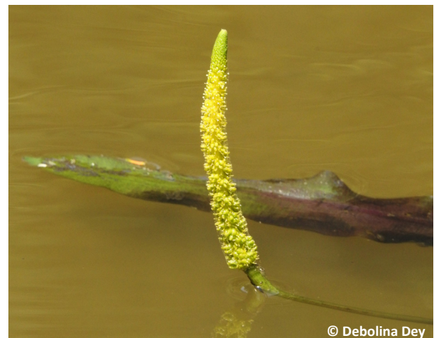
Image 2. Inflorescence of Aponogeton lakhonensis with floating leaves.

from top of tubers. Leaves both submerged and floating, petiolate. Submerged leaves brittle, petiolate; petioles 10–12 cm long, sheathing at base; lamina 9–22 x 4.3–5 cm, oblong-lanceolate, round at base, round to obtuse at apex, midrib prominent with 6–8 parallel nerves. Floating leaves slender, terete; petiolate; petioles 35–40 cm long; lamina 13.5–26 x 4.6–5.2 cm, oblong, cordate at base, narrow to round at apex, midrib prominent with 6–8 parallel nerves. Spathe c 2.2 cm long, membranous, caducous and acute. Peduncles 20–30 cm long, 0.4 cm in diameter, cylindrical, green, slightly thickening towards inflorescence. Spike simple, greenish-yellow, 8–9 cm long, flowers yellow, spirally arranged all around inflorescence, extending to 7–14 cm in infructescence.