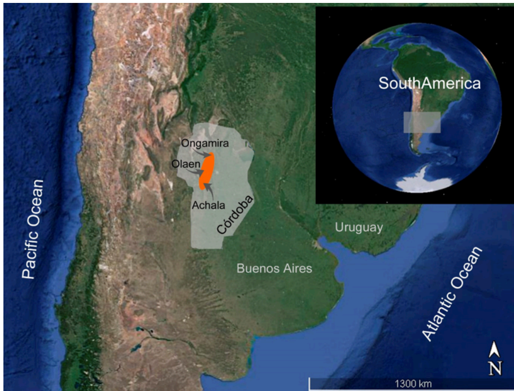
Image 2. Distribution area of Austroborus cordillerae (orange area) in central Argentina, South America.