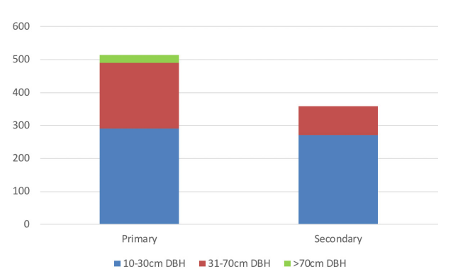
Figure 2. Tree densities per hectare between primary and secondary forest, with the three diameter at breast height (DBH) size classes.

We observed R. waldeni in secondary forests feeding on fruiting native trees together with P. panini , Pink-