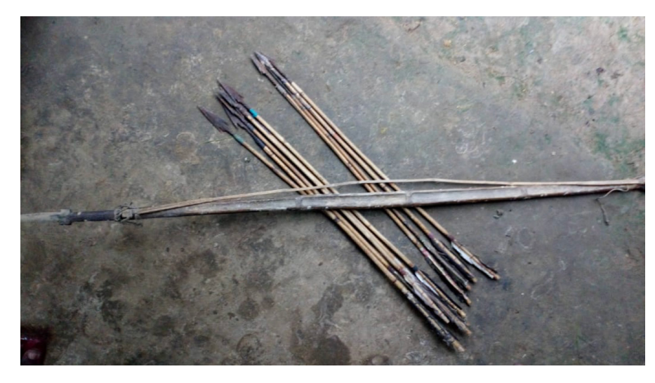
Image 2. Bow and arrow for hunting mammals like Jungle Cat and Jackal.

Indigenous communities harvest wild animals worldwide for different purposes which constitute essential ingredients in daily livelihoods (Ferreira et al. 2009). Santal and Oraon are two closely related indigenous communities of Bangladesh that rely on agricultural day labor. They are unable to buy meat from markets due to their poverty. As a result, they are compelled to hunt wildlife, especially for animal protein consumption. Again, it is seen that they go hunting whenever they are free or jobless. However, many of the respondents of this study also think that the wildlife population is declining due to hunting. We recommend some measures for the conservation of hunted animals in the area.