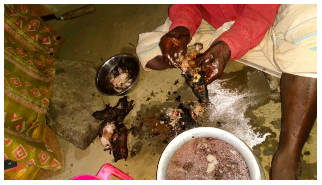
Image 1. Oraon male processing hunted rats for consumption.