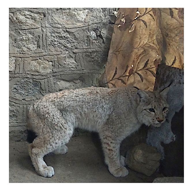
Image 1. Eurasian Lynx Lynx lynx rescued on 29 December 2020 in Kungyam village, Ladakh.

administering the ketamine and dexmedetomidine mixture until complete recovery.