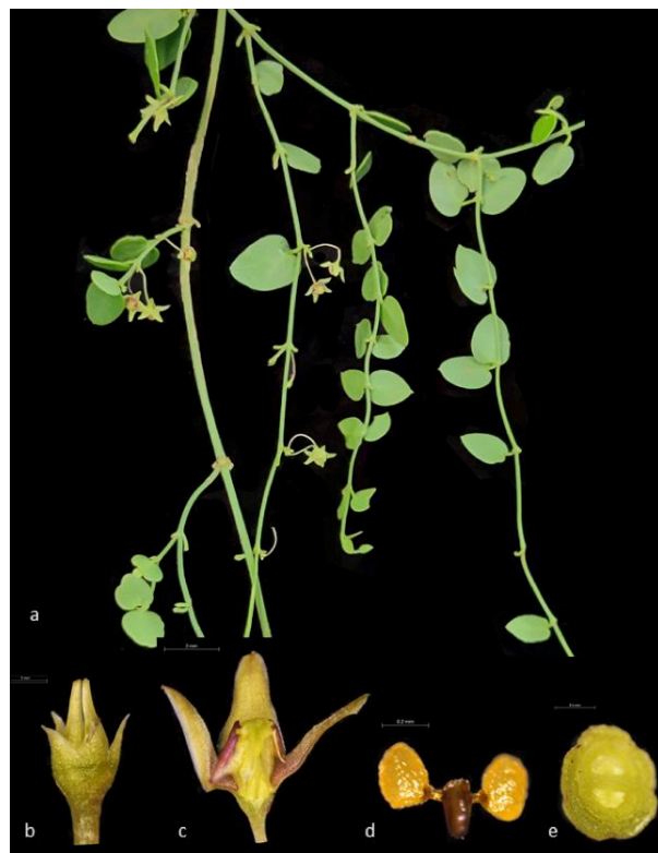
Image 2. Pentatropis capensis : a—Habit | b—Calyx | c—Flower LS | d—Pollinia | e—Ovary CS.

Herbaceous twiners. Stem slender, glabrous, greenish-purple. Leaves simple, opposite, ovate, 1–3.5 × 0.5–2.5 cm, base rounded or cordate, margin entire, apex obtuse mucronate, glabrous, semi-succulent, petiole 4–7 mm long. Flowers in axillary umbels, 3–4 flowers per umbel, greenish-purple colour, buds subglobose; pedicel filiform, 1.7 cm long. Calyx 5-partite, lobe elliptic-lanceolate, 1.5 mm long, hyaline at margin, acute at apex,