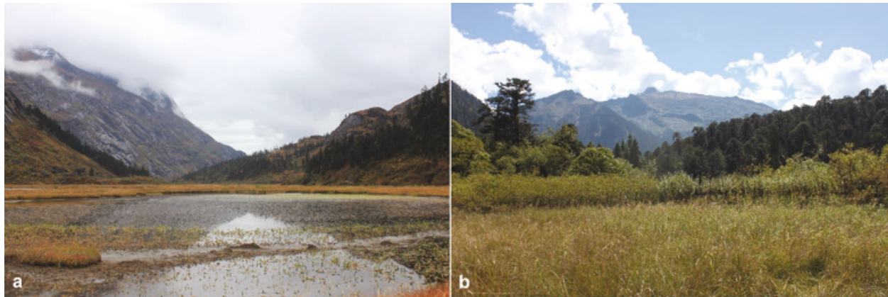
Image 2. The microhabitat observed for three breeding populations of Bufo gargarizans in Dibang Valley, Arunachal Pradesh, India: a—riverine marshes covered in grass and other aquatic vegetation | b—bogs covered in tall thick grass.