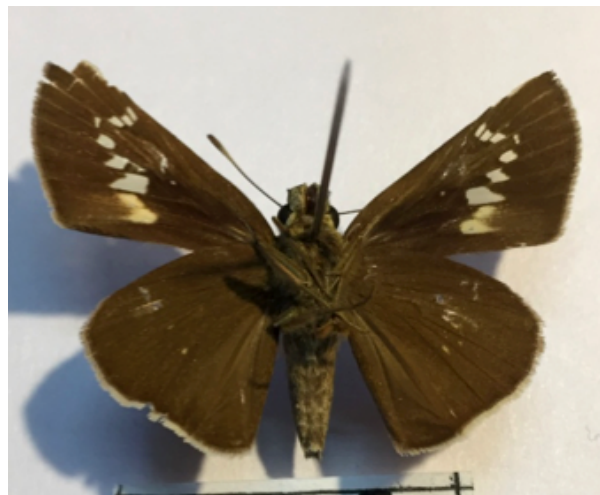
Image 1. Blank Swift Caltoris kumara moorei (Evans, 1926) female collected from New Forest, Dehradun, Uttarakhand (lower western Himalaya) on 21.ix.2018: a—dorsal view | b—ventral view.