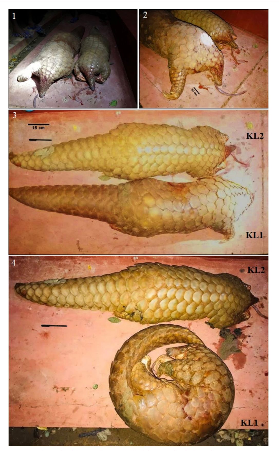
Images 1–4. Photographs of the two Indian Pangolins (coded as KL2 and KL2) taken at the DWC Assistant Director Office at Madu, Mannar District, Sri Lanka.