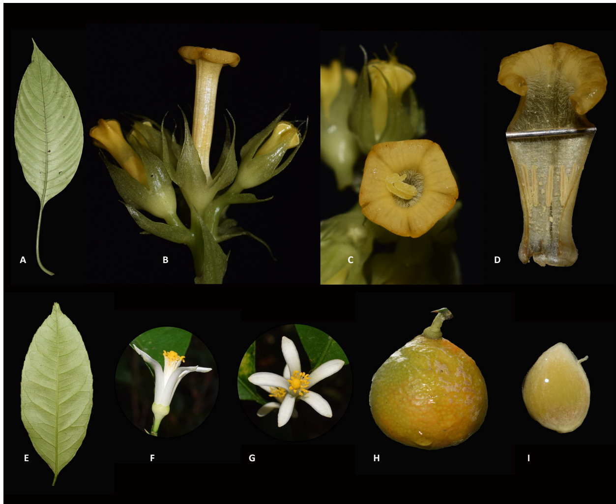
Image 2. New records for the flora of Arunachal Pradesh. (A–D)— Mycetia mukerjiana Deb & Ratna Dutta: A—leaf | B—inflorescence | C—flower top view | D—open flower showing stamens. (E–I)— Citrus indica Yu. Tanaka: E—leaf | F & G—flower | H—fruit | I—seed.

Pradesh, and six endemic to the eastern Himalaya (Appendix 1). Among these, new distribution localities were recorded for two endemic species. Their details are as follows: