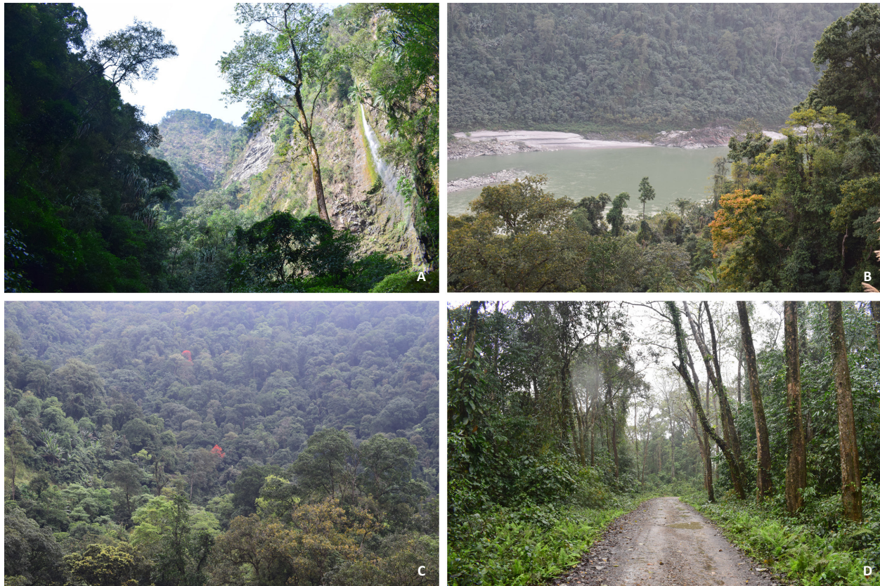
Image 1. Different habitat types of East Siang District: A—perennial waterfall at Sirki | B—evergreen forest along the Siang river basin | C—dense tropical forests at Pasighat | D—open tropical forests at Ruksin.