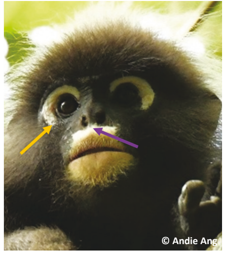
Image 5a. The same adult male Dusky Langur in Woodlands (left) and Thomson Nature Park (right).