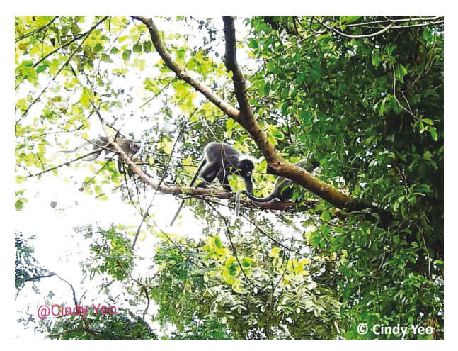
Image 6a. An adult male Long-tailed Macaque chasing two Dusky Langurs.