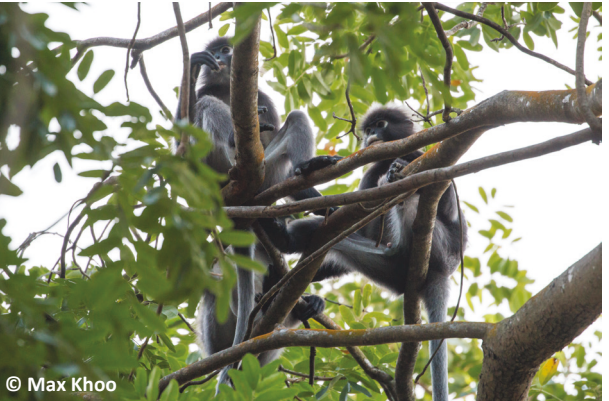
Image 1. Three Dusky Langurs, with at least one male, at 891B Woodlands Drive 50.

On 18 January 2020 at 17.20h, a member of the public reported a sighting of two Dusky Langurs at Upper Peirce Reservoir Park, which is adjacent to Thomson Nature Park, feeding on Saga Adenanthera pavonina leaves. Sometime later, a group of at least three Longtailed Macaques approached, and an adult male began chasing the langurs away from the tree (Image 6a). Both species acted aggressively by baring teeth (Image 6b), but no loud calls were heard during the encounter and the langurs moved away. On the next day in Thomson Nature Park we observed a group of 11 Raffles' Banded Langurs feeding on Saga seeds (Image 7). At 16.15h, two Dusky Langurs appeared and chased after the banded langurs. Alarm calls were exchanged and the Banded Langurs scattered out of sight. The Dusky Langurs then took over the Saga tree, although feeding was not observed. The following day at 08.12h, we observed the same pair of two Dusky Langurs (facially identified using photographs) at Thomson Nature Park, 203m (measured on Google Earth) from the site of encounter with the banded langurs a day earlier. As the dusky langurs sighted in both Woodlands and Thomson Nature Park have been identified to be the same group, this would mean that the Dusky Langurs travelled from the northern part to the central part of Singapore in approximately