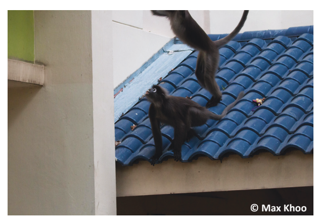
Image 2. Two Dusky Langurs jumping to a building ledge from the roof of a covered walkway.