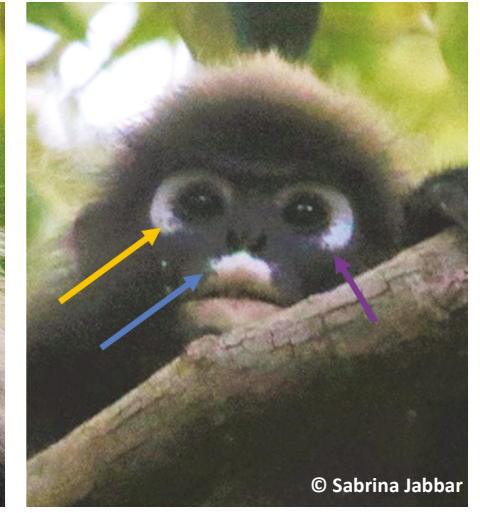
Image 5b. The same subadult male Dusky Langur in Woodlands (left) and Thomson Nature Park (right).