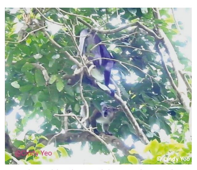
Image 6b. An adult male Long-tailed Macaque baring teeth at an adult Dusky Langur male.

limbs moving alternately through the water directly beneath their body (Dagg & Windsor 1972; Gabbatiss 2017). Moreover, Asian colobine primates like Dusky Langurs often exhibit male dispersal when they reach subadult-hood. Given this, along with the initial sighting of the Dusky Langurs at Woodlands being very close to Johor, it is plausible that the Dusky Langurs may have come from neighbouring Malaysia.