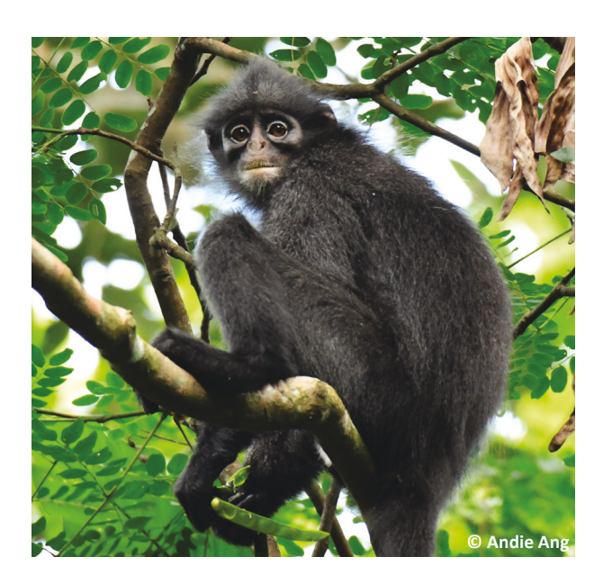
Image 7. Raffles' Banded Langur adult female feeding on Saga Adenanthera pavonina seeds on 19 January 2020.

Malaysia during the Pleistocene (Ang et al. 2020), the sympatric occurrence of Dusky Langurs and Raffles' Banded Langurs in Singapore is novel. On one occasion in Thomson Nature Park, although there were only two Dusky Langurs, they displayed aggressive territorial behaviour toward the native and Critically Endangered Raffles' Banded Langurs and displaced them from a food resource. As the Raffles' Banded Langurs are naturally