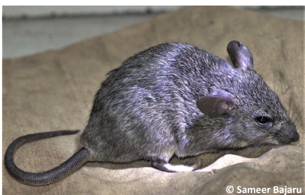
Image 2. Millardia meltada