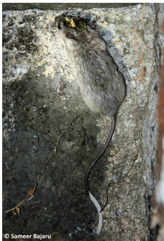
Image 7. Madromys blanfordii