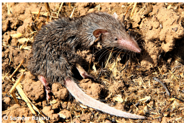
Image 8. Suncus murinus