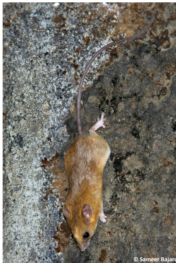
Image 10. Vandeleuria oleracea

trapping this highly arboreal species, the squirrels came for the bait put in the ground-laid traps. Its abundance was relatively higher (3.90% of total catches) than the other arboreal rodents, viz., R. rattus and M. blanfordii . The individuals trapped in February were found to be reproductively active.