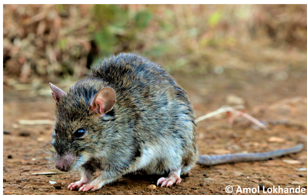
Image 1. Millardia kondana