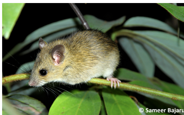
Image 6. Rattus satarae