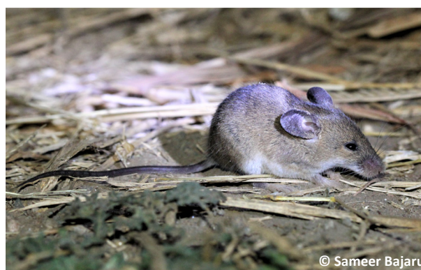
Image 4. Mus booduga