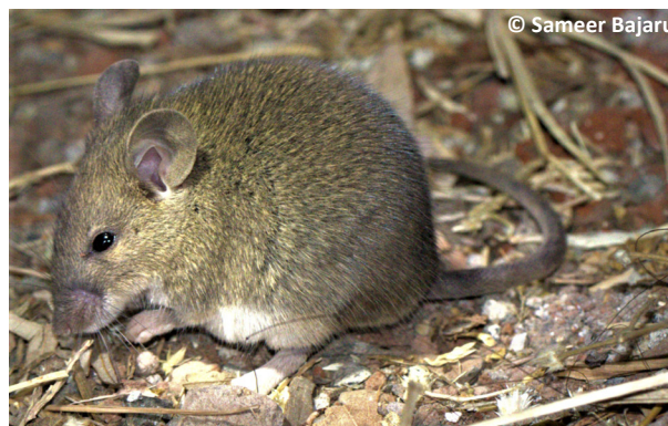
Image 3. Mus saxicola