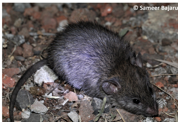
Image 11. Bandicota bengalensis