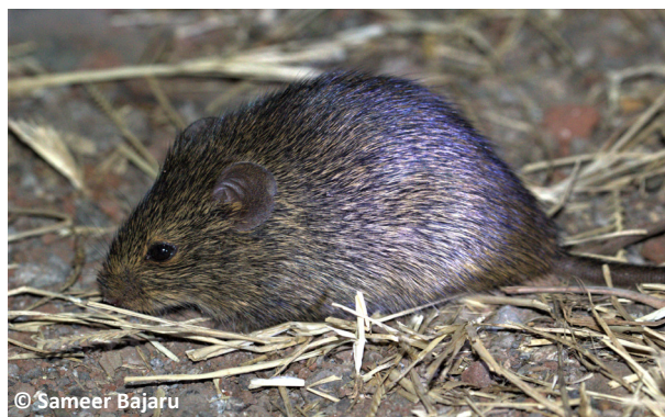
Image 5. Golunda ellioti

This species is endemic to the Western Ghats. It is similar in appearance to F. palmarum but is larger in size with a rufous forehead, flanks, and underside of the tail (Table 3). All specimens trapped were from the forested areas, and usually away from human settlements. Though we did not place traps above the ground for