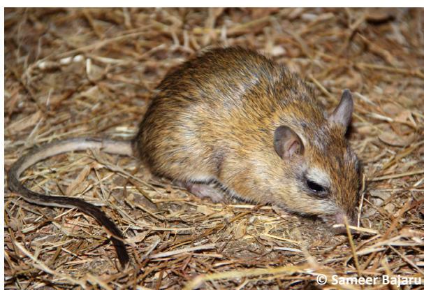
Image 9. Tatera indica