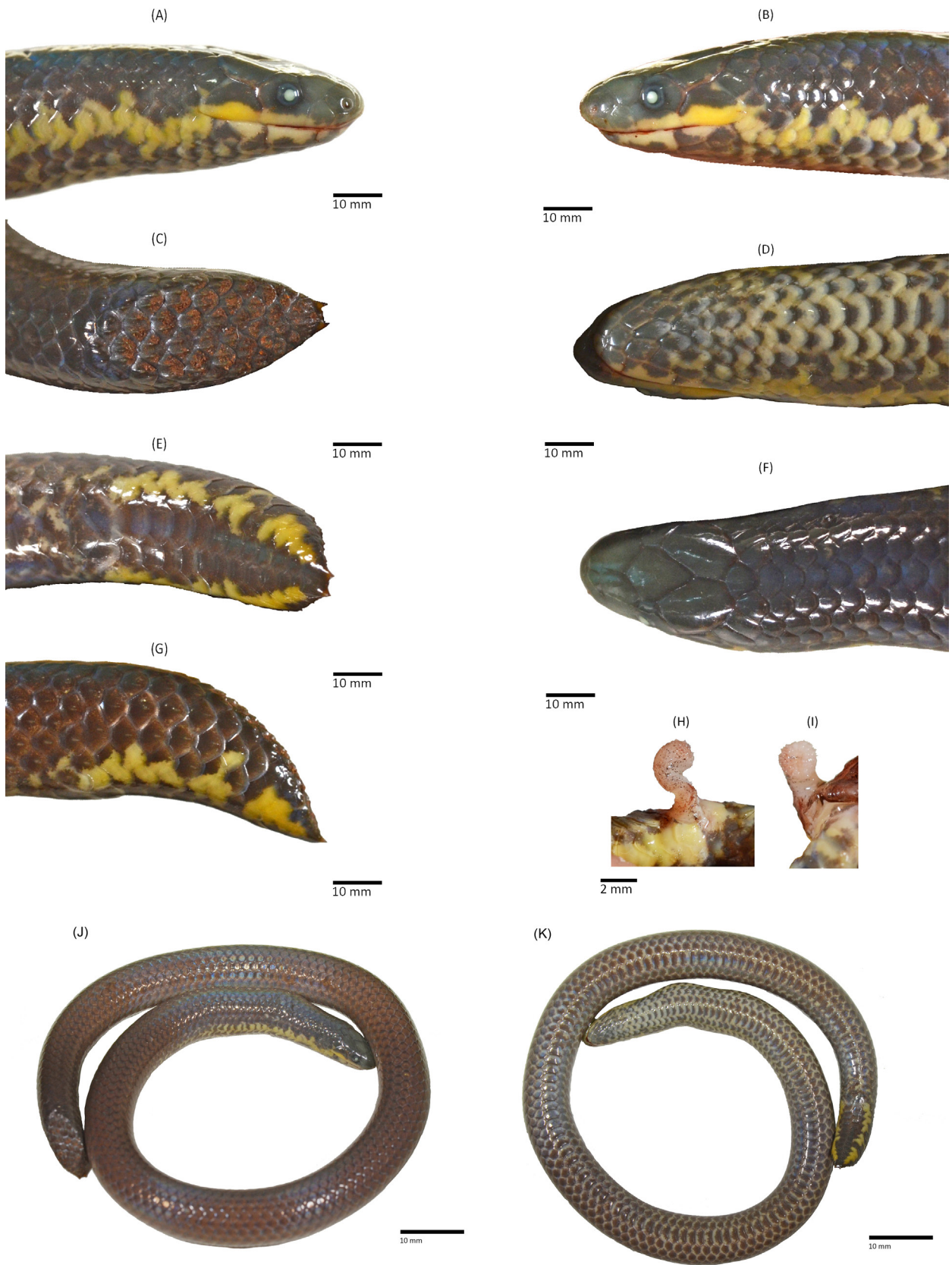
Image 1. Profile close-ups of head and tail shield in lateral, dorsal and ventral views (A–I) and entire, dorsal and ventral views (J–K) of BNHS 3359, holotype of Uropeltis rajendrani sp. nov.