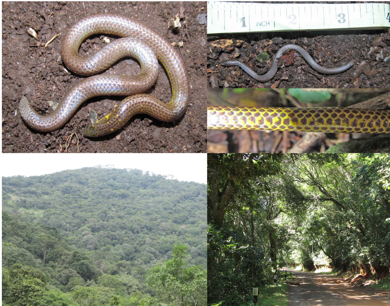
Image 2. Live uncollected topotypes (adult and juvenile), view of forest cover at the type locality – the Kolli Hill complex, southern Eastern Ghats, Tamil Nadu.

of two ventrolateral red stripes; much higher ventral counts (165–172); U. shorttii (southern Eastern Ghats, allopatric): dorsal body brownish or bluish-black, with distinct yellowish annuli or crossbars; ventral counts comparatively lower (141–156).