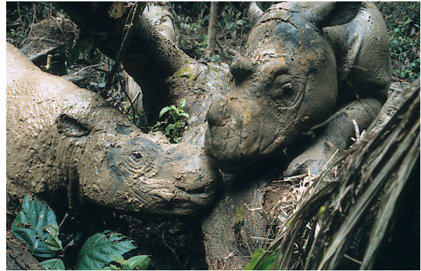
Image 3. In contrast to decades of unreliable surveys, direct observation and analysis has been the only source of relevant information for productive management.

After 25 years of perfecting tools and techniques in captivity, the Sumatran Rhino Sanctuary (SRS) design in Way Kambas is currently the only option for successful reproductive management of Sumatran Rhinos. Only in this environment can the essential management information be obtained, and reproduction optimized. Fertility monitoring for this species requires confirming