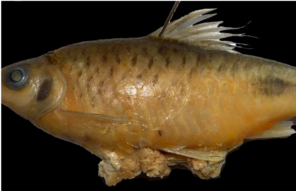
Image 5. Gravid female P. filamentosus (ZSI/SRS F.8368, 113mm SL), showing filamentous extensions of the dorsal fin branched rays.