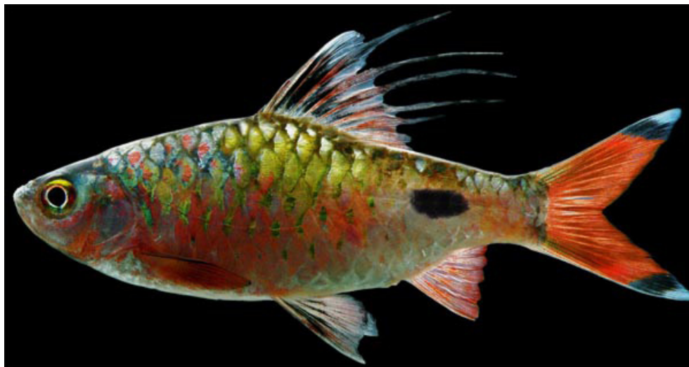
Image 7. Adult male P. filamentosus collected from lakes near Sriperambathur, Tamil Nadu, India (116.0mm SL, ZSI/SRS F.8368).

seven species, two of which ( P. singhala and P. srilankensis ) are endemic to Sri Lanka. We have not in the present study examined Sri Lankan material but have relied on data provided in Pethiyagoda & Kottelat (2005a). The 4 th lateral row scale above the 4 th lateral-line scale and 7 th lateral-line scale of P. rohani sp. nov. was compared with those of P. filamentosus collected from Chembarampakkam Lake (Image 4) and found to be very different. The scales of P. rohani sp. nov. (3 ex.) have longer and fewer radii meeting at the focus, which is not reticulate, while the scales of P. filamentosus (5 ex.) from Chembarampakkam had numerous short radii meeting at a largely reticulated focus.