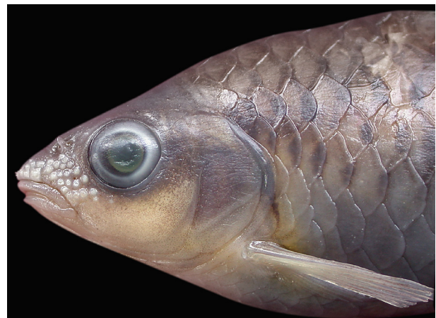
Image 2. Snout of Puntius rohani sp. nov. holotype, 69mm SL, ZSI/SRS F.8336, showing dense tuberculation.