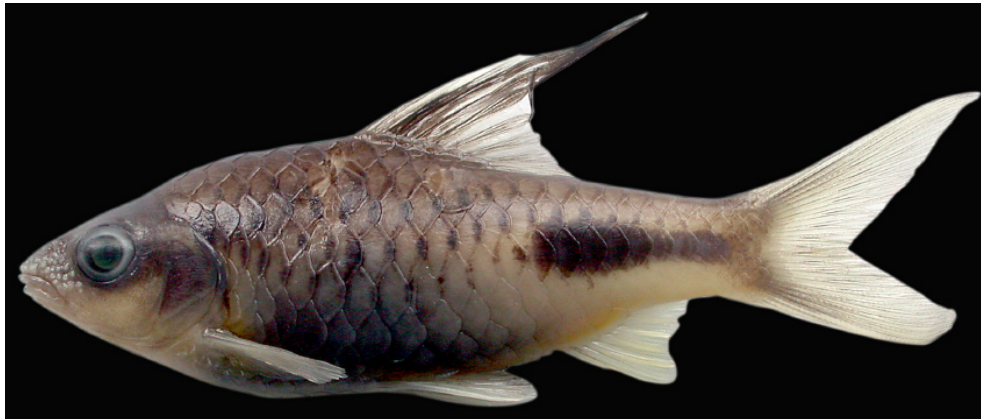
Image 1. Puntius rohani sp. nov. holotype, 69mm SL, ZSI/SRS F.8336.