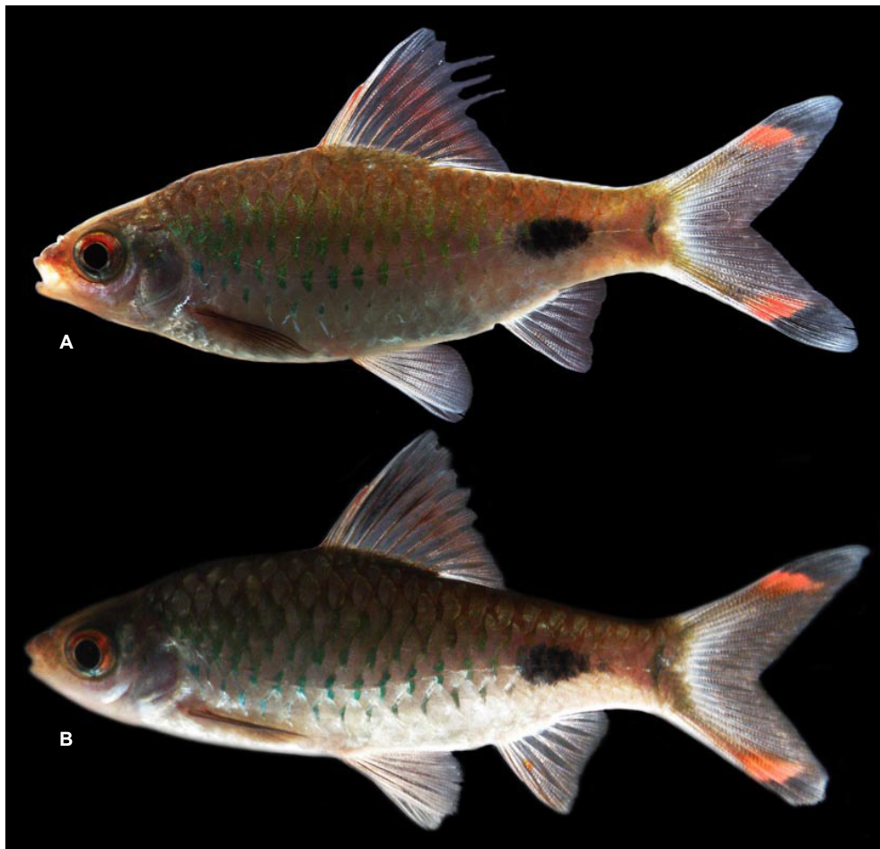
Image 6. A - Male P. filamentosus maintained alive in aquaria with filamentous extensions to the dorsal-fin branched rays (5 December 2009); B - the same specimen with the dorsal-fin filaments absorbed (27 May 2010).