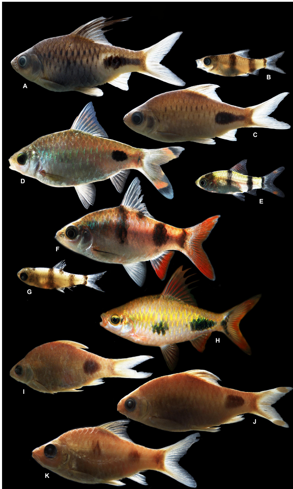
Image 3. A - P. rohani sp. nov. (holotype); B - P. rohani sp. nov. juvenile; C - P. rohani sp. nov. (paratype, ZSI/SRS F.8345, 80mm SL); D - P. filamentosus (live specimen, uncatalogued); E - P. filamentosus juvenile (live specimen, uncatalogued); F - P. tambraparniei (ZSI/SRS F.8369, 57mm SL); G - P. tambraparniei juvenile (ZSI/SRS F.8370, 14mm SL); H - P. exclamatio (live specimen, uncatalogued); I, J - P. assimilis (ZSI/SRS F.8371, 84mm SL); K - P. arulius (ZSI/WGRC F.3954, 74mm SL).