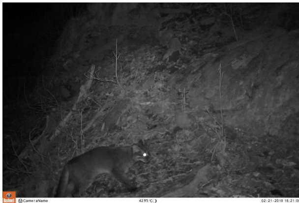
Image 1. Asiatic Golden Cat recorded in Gaurishankar Conservation Area on 21 February 2019.

Gaurishankar Conservation Area is an area of high biodiversity, however, there are several threats to its ecological sustainability. The Lapchi Valley is part of an ancient trade route to Tibet. Two hydropower projects have been proposed to be constructed, and