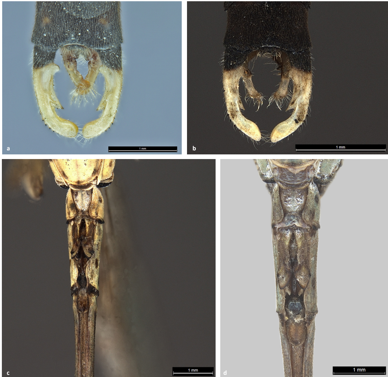
Image 12. Comparison of genitalia. Male anal appendage: a— Platylestes kirani sp. nov. | b— Platylestes platystylus . Male secondary genitalia: c— Platylestes kirani sp. nov. | d— Platylestes platystylus .

suture thin black, two small black spots at the upper and lower ends; four black spots on mesepimeron, two at its upper third, one over the spiracle and one at the lower third; metepimeron greenish-yellow with two black spots at upper and lower ends; pleura of fore coxa with a small black stripe; antealar sinus pale blue; undersurface of thorax pale yellowish- green with two black spots between the hind legs; legs pale yellowish-white with black stripes on extensor surfaces of femora and tibiae on forelegs, mid legs and hind legs; a black spot on each hind coxa, underside of each coxa black, claws black;