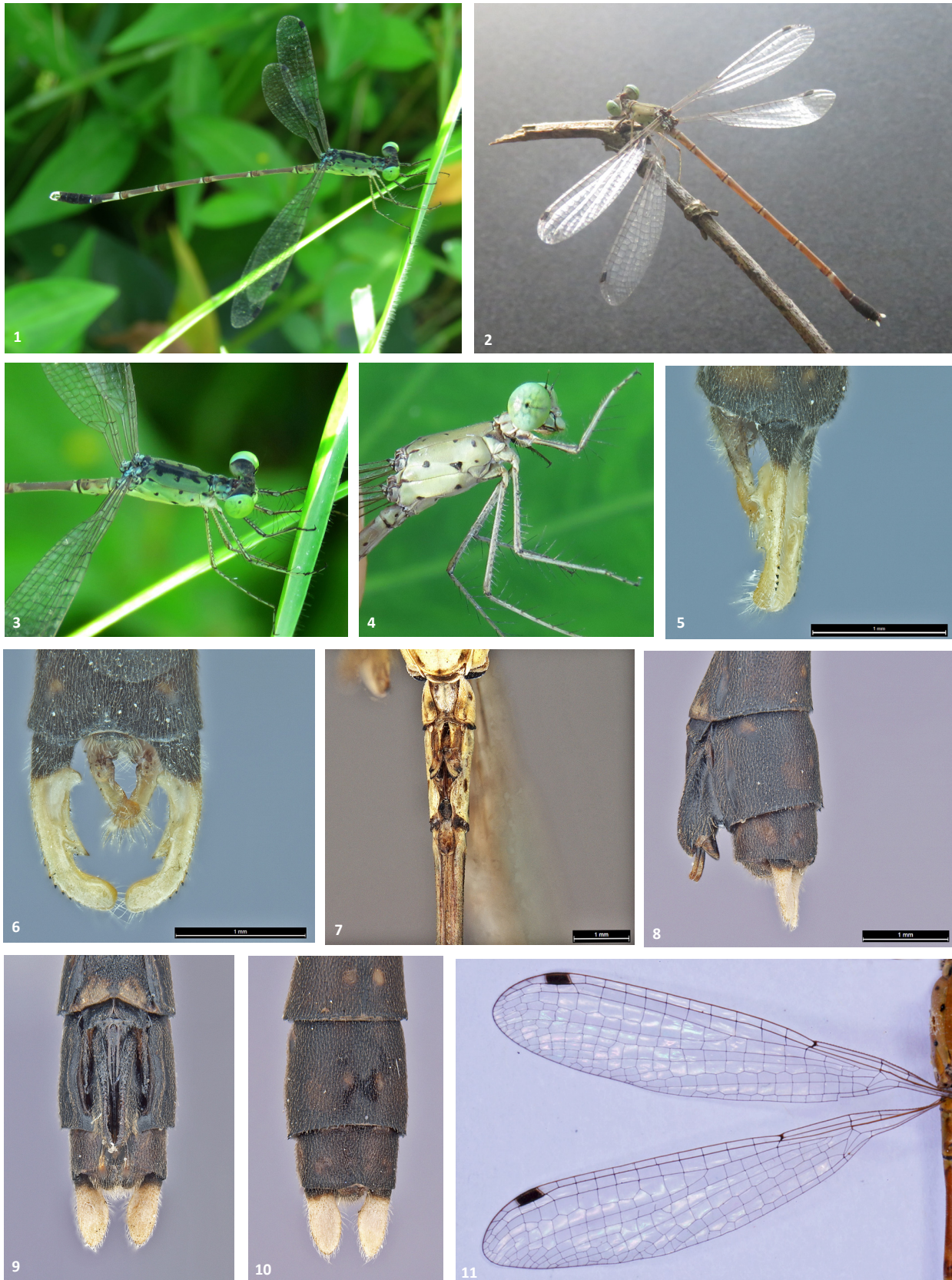
Image 1–11. Platylestes kirani sp. nov. 1—Adult male | 2—Adult female | 3—Head and thorax of male | 4—Head and thorax of female | 5—Male and appendage - lateral view | 6—Male anal appendage - dorsal view | 7—Secondary genitalia of male | 8—Female anal appendage - lateral view | 9—Female anal appendage - ventral view | 10—Female anal appendage - dorsal view | 11—Wings.