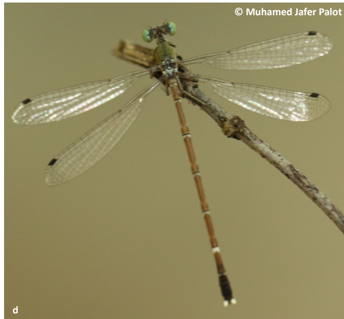
Image 13. Comparison of adult specimens of Platylestes kirani sp. nov. and P. platystylus : a— Platylestes platystylus - male | b— Platylestes platystylus - female | c— Platylestes kirani sp. nov. - male | d— Platylestes kirani sp. nov. - female

ends; segment 7 with yellow spot fused and extended laterally; segment 8 with a greenish-blue crescent marking; segment 9 and 10 black, without marking; segment 1 and 2 with small black spots ventrally; segments 2–6 with black apical rings, pale yellowish-green with a blue tinge underside; anal appendages as in P. platystylus , creamy white, base of superior