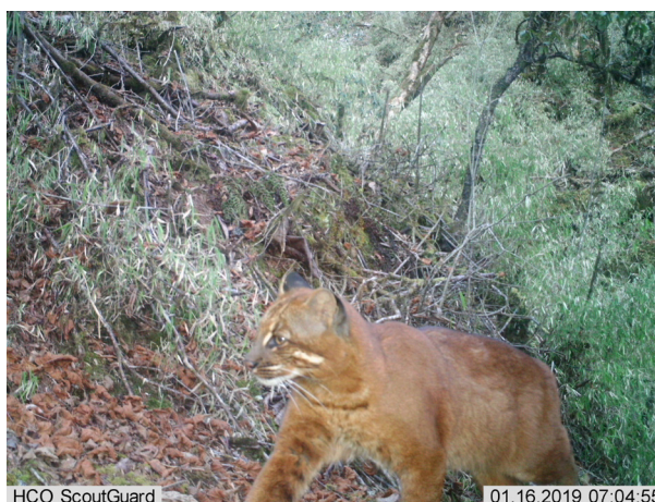
Image 4. Golden morph of Asiatic Golden Cat recorded at 3,698m on 16 January 2019.

comprehensive research focussed on the ecology of the Asiatic Golden Cat in Bhutan. The results will form a basis for developing a conservation action plan for the species in Sakteng Wildlife Sanctuary and other areas in the country.