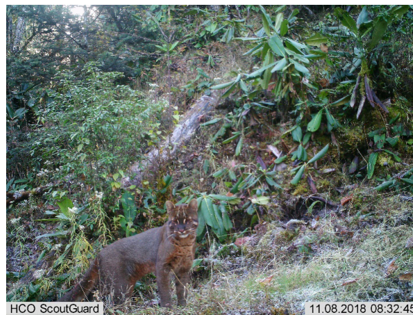
Image 2. Buff brown morph of the Asiatic Golden Cat recorded at 3,240m on 8 November 2018.