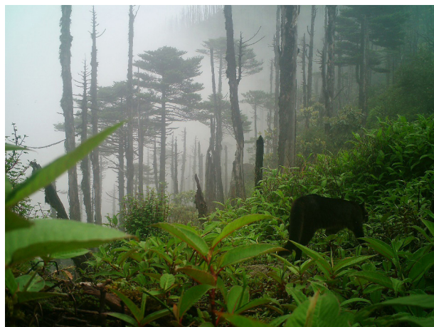
Image 1. Melanistic morph of the Asiatic Golden Cat recorded at 3,340m on 11 December 2018.