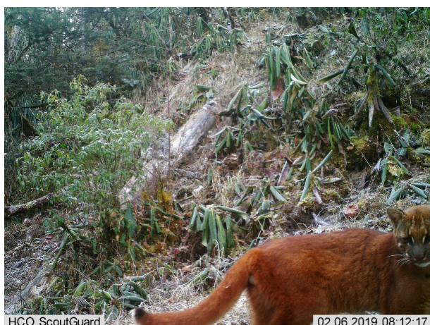
Image 3. Golden morph of Asiatic Golden Cat recorded at 3,240m on 6 February 2019 © Sakteng Wildlife Sanctuary.