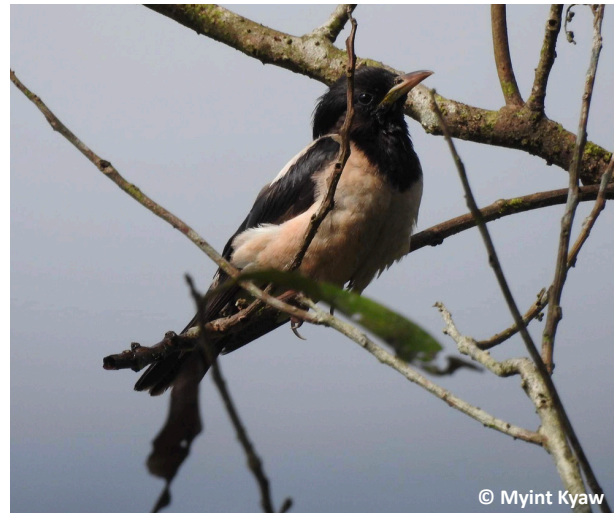
Image 1. Rosy Starling Pastor roseus resting on a tree in Naung Mung Village, Kachin State, Myanmar, 20 September 2018.