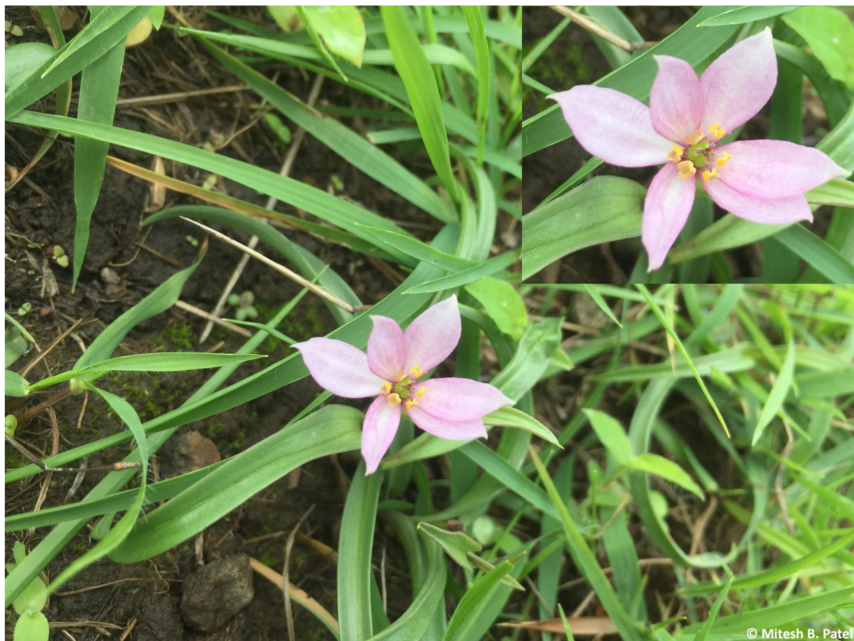
Image 1. Iphigenia stellata in habitat.