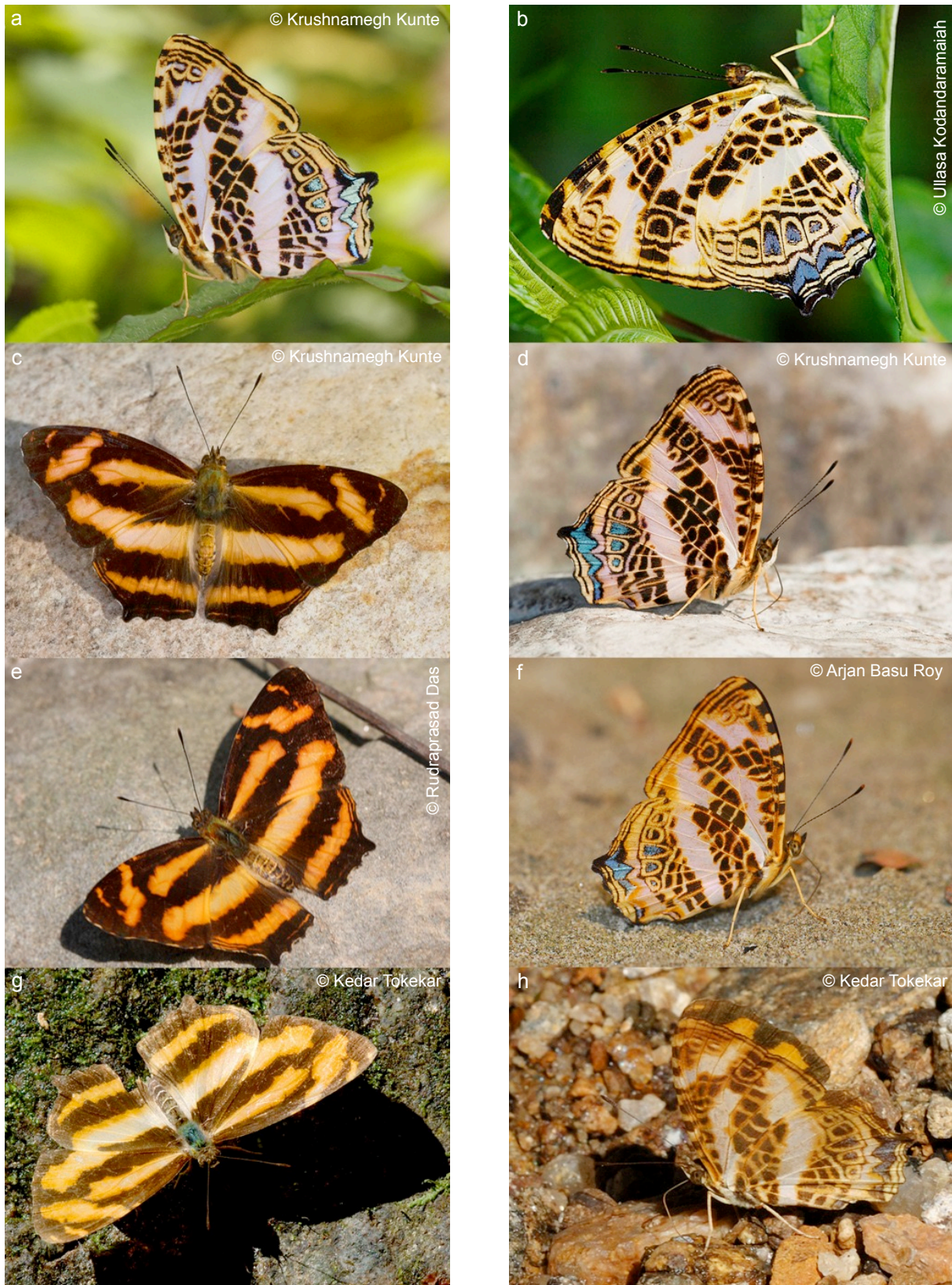
Image 3. Recent S. silana sightings: (a) Namprikdang Rest House, North Sikkim, 16/04/2008; (b) Namprikdang Rest House, North Sikkim, 19/04/2008; (c) and (d) same individual, Pabung Bridge, West Sikkim, 08/11/2009; (e) and (f) same individual, Chidiapung, Namdapha Tiger Reserve, eastern Arunchal Pradesh, 17/03/2009; (g) and (h) same individual, Nokrek National Park, Garo Hills, Meghalaya, 09/11/09. (e) and (f) are dry season forms, others are wet season forms.