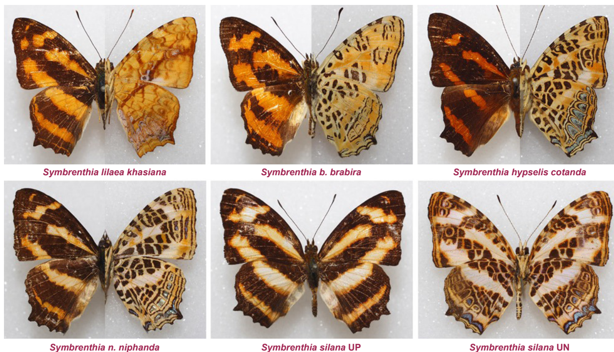
Image 1. Species of Indian Symbrenthia . Shown on the left are dorsal and on the right ventral wing surfaces for each specimen except S. silana , in which upper and under sides are illustrated separately. Sexes are similar. Identification key is given by Evans (1932).

colleagues have photographed three more specimens at Namprikdang, Namdapha Tiger Reserve (Arunachal Pradesh) and Nokrek National Park (Meghalaya). Details of all these sightings are provided below.