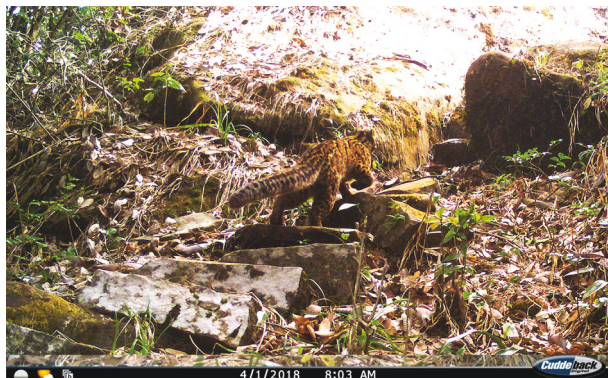
Image 1. Camera trap image of the Marbled Cat Pardofelis marmorata from Benreu Village in Nagaland, India.