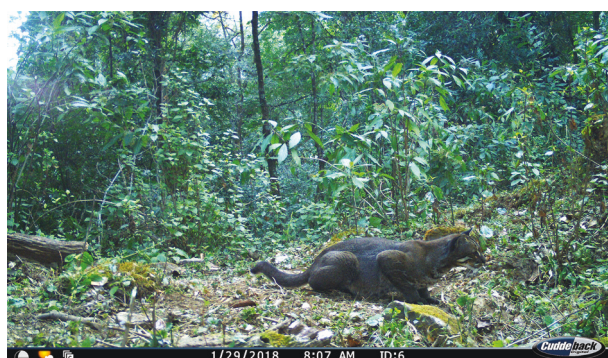
Image 3. Camera trap image of the Asiatic Golden Cat Catopuma temminckii from Jotsoma Village in Nagaland, India.