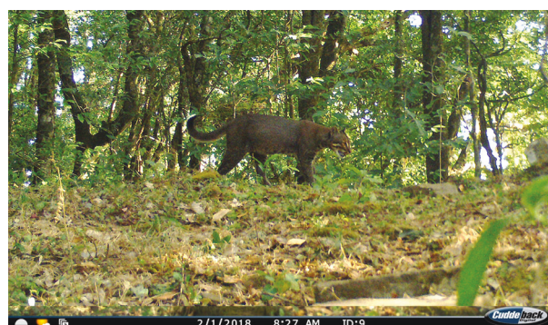
Image 4. Camera trap image of the Asiatic Golden Cat Catopuma temminckii from Jotsoma Village in Nagaland, India.

felid presence in northeastern India, particularly in the community-owned forests of the region.