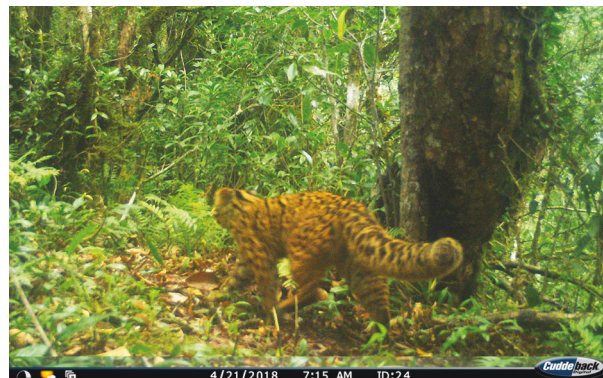
Image 2. Camera trap image of the Marbled Cat Pardofelis marmorata from Khuzama Village from Nagaland, India.