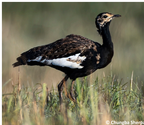
Image 1. Bengal Florican Houbaropsis bengalensis