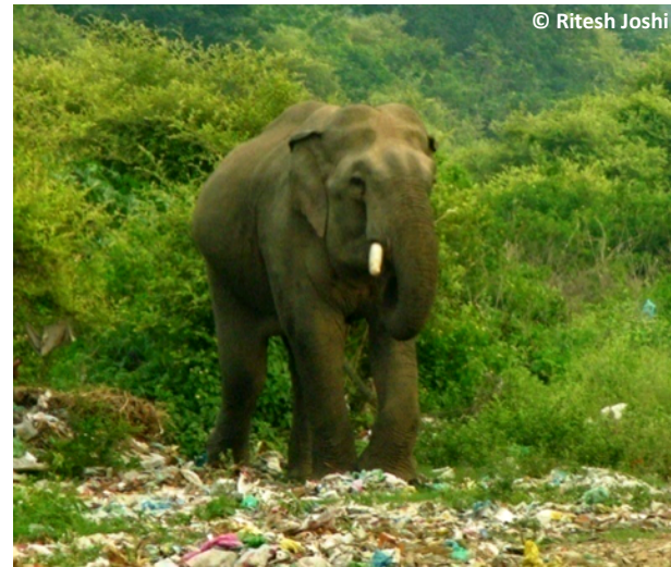
Image 2. An adult male Asian Elephant feeding from the waste near Shyampur forest of Haridwar Forest Division in the year 2007 (now is a part of Rajaji Tiger Reserve).

An inspection done by the state forest department during the year 2015 at Shyampur forest indicated that at a few places, the biodegradable and non-biodegradable waste, originating from Haridwar City, was not being disposed-off properly (Anonymous 2015). Between the years 1995 and 2015, more than 100,000 ton of garbage has been dumped in this site every year, including 300 tons of garbage every day from the Haridwar Municipal Corporation (Sharma 2015). Fortunately, in the year 2015–2016, the Corporation started dumping of the city's garbage in a piece of government land near Sarai Village in Haridwar. Since the year 2016, any kind of garbage is not being thrown at the east Ganga canal site. Elephants use this track to visit the river Ganga crossing