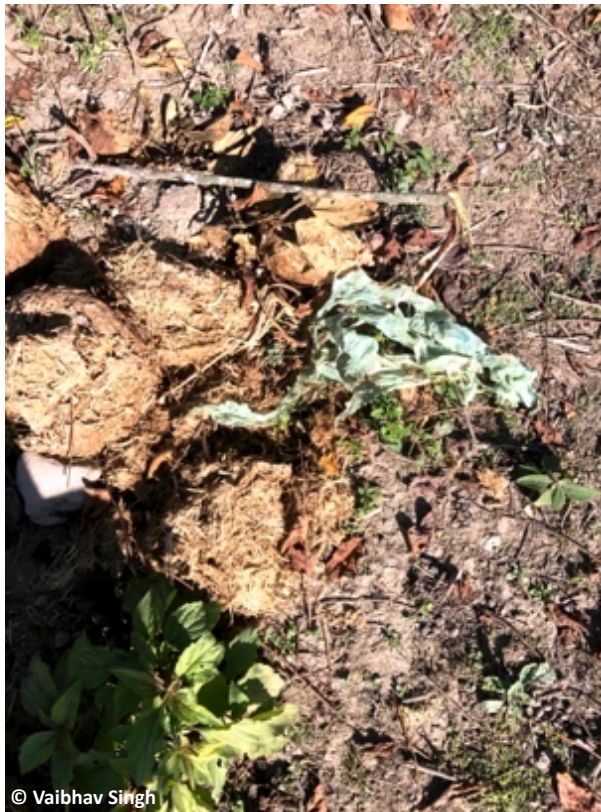
Image 3. The remains of plastic bag recorded from the dung-piles of elephant in Kosi forest of the Ramnagar Forest Division.

facilitates the frequent movement of elephants across the area. The garbage accumulated at both the sites (in Sitabani Temple and Chhoi Village) was found temporary. On examining the garbage, it was found that the garbage mainly consisted of leftover food, vegetable residues, wrappers of chips, etc.