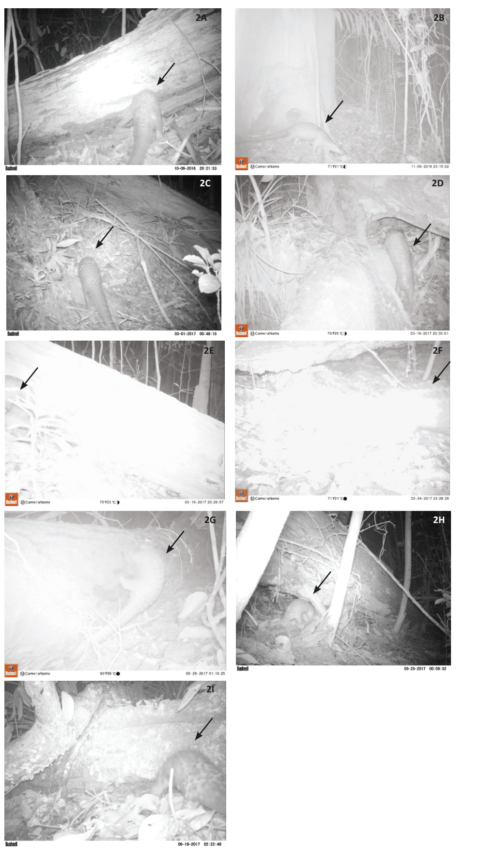
Figure 2. Nine images of Sunda Pangolin that were recorded during the survey.