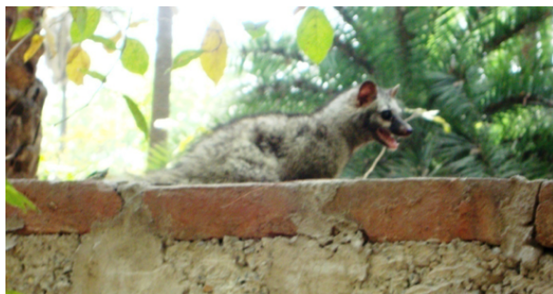
Image 1. Common Palm Civet in Patna Bird Sanctuary.

nature and composition of undigested plant or animal matter; however, the ambiguous scats were not used in analysis. The scats were collected from November 2012 to March 2013. Scats were collected from identified dens of Common Palm Civets and stored in zipped polythene bags and additional information was recorded such as habitat, GPS coordinates, time and date of collection. The collected scats were sun dried, and washed in running tap water through a sieve. The remains, like hairs, feathers, seeds, bones, grasses were separated and sun dried for further identification of species and observation through microscope and macro lens. At least 20 hairs were picked randomly from each scat. The hairs were treated with xylene to see clear structure of medulla. These hairs were mounted on permanent slides and observed under microscope to identify the prey species. The hairs were compared with the already