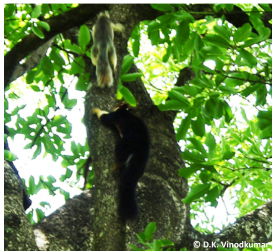
Image 4. The Indian Giant Squirrel chasing the Grizzled Giant Squirrel at Marayur RF