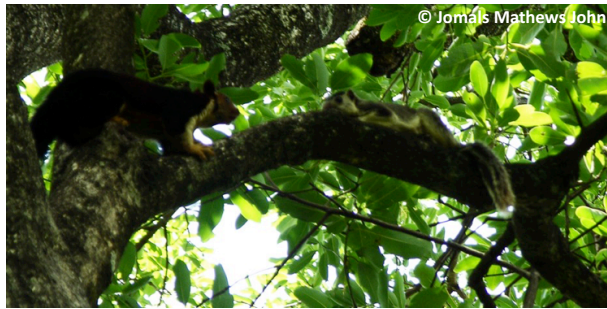
Image 3. The Indian Giant Squirrel and the Grizzled Giant Squirrel staring each other after the copulation at Marayur Forest Division in Kerala, southern India