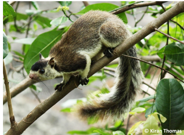
Image 2. Grizzled Giant Squirrel Ratufa macroura