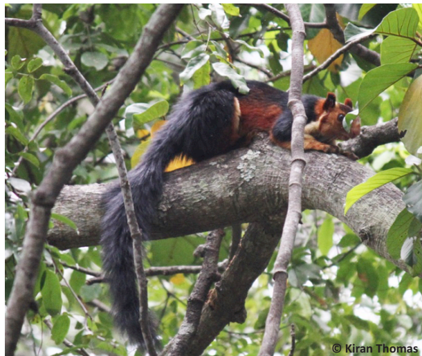
Image 5. A hybrid between Indian and Grizzled Giant Squirrel in the Churulipetti area of Chinnar WS, Kerala, southern India

(Thomas & Nameer 2018). There were five instances between August 2013 and April 2014 (Table 1) when we encountered the suspected hybrid individuals at the