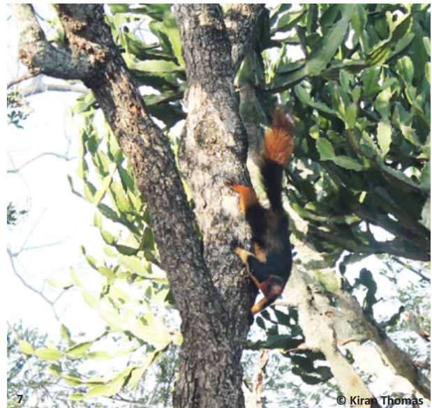
Image 6–7. 6 - Hybrid individuals between GGS and IGS showing varying pelage colour; 7 - Hybrid individual between GGS and IGS

sanctuary, the locations of which were mapped (Fig. 2). The general structure of the pelage colour of these hybrids was a mixture of both R. indica and R. macroura . We could, however, observe three different pelage patterns among the hybrid individuals. In one case, the pelage looked similar to that of R. indica , excepting the creamy white underparts and the cheeks, which were brown to chocolate brown in colour and the tail has chestnut tinge (Image 5). The second type of pelage looked similar to that of R. macroura , excepting that the grizzled upper part of the individual appeared brown to black in color (Image 6). The third type of pelage encountered was similar to that of the darker form of R. indica but the tail, instead of being completely black, had a pale tip (Image 7), a character similar to that of R. i. indica .