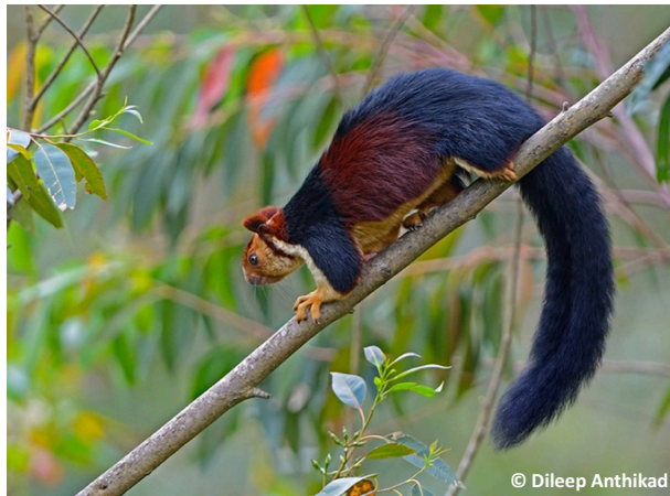
Image 1. Indian Giant Squirrel Ratufa indica