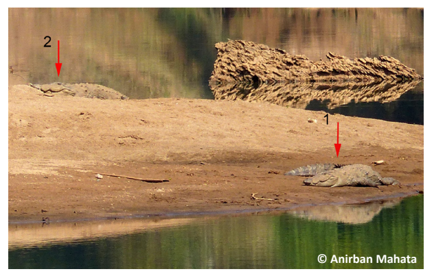
Image 2. Two adult Mugger Crocodylus palustris Lesson, 1831 basking along the Saberi River bank near Siribeda Village of Koraput, southern Odisha, India.

2017, we saw and photographed one adult Mugger with an approximate length of 3.3m (11ft) long from snout to tail tip near Kenduguda Village (Image 1) situated along the upstream at about 2km from Siribeda Village. On the same day, we further saw and photographed two more adult Muggers with approximate size of 3m (10ft) and 3.3m long from snout to tail tip near Siribeda village (Image 2). All the recorded localities are situated within a stretch of around 23km within the Gupteswar proposed reserve forest and characterized by perennial and slow flowing river with wider river bed along with sandy and muddy banks. The surrounding forest cover of the localities broadly falls under moist deciduous type