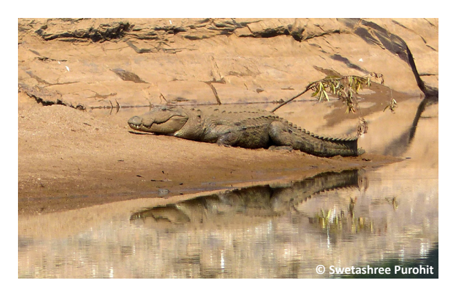
Image 1. An adult Mugger Crocodylus palustris Lesson, 1831 basking along the Saberi River bank near Kenduguda Village of Koraput, southern Odisha, India.