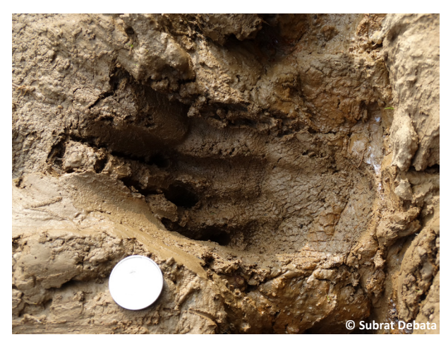
Image 3. Spoor mark of a Mugger Crocodylus palustris Lesson, 1831 along the river bank of Saberi in Koraput, southern Odisha, India.