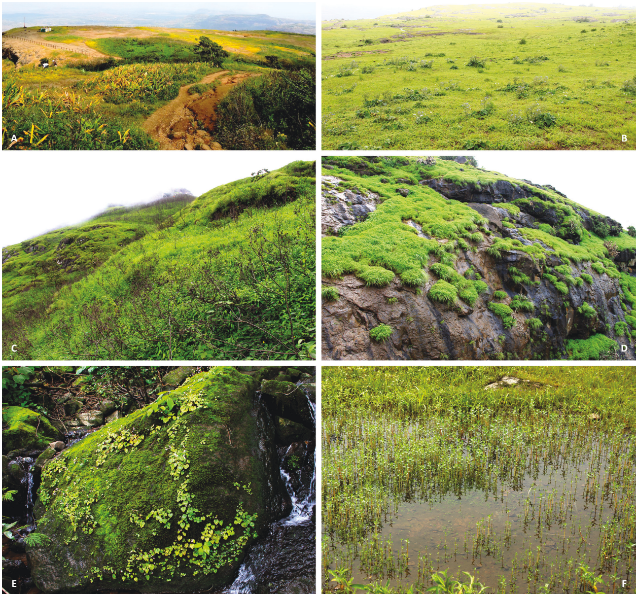
Image 1. Major habitat of Anjaneri Hill: A—Top elevation plateau | B—Middle elevation plateau | C—Slope | D—Steep and hanging rocks | E—Black boulders with seasonal stream | F—Seasonal pond at top plateau.

latifolium (1,300m), Ceropegia anjanerica (1,300m), Euphorbia khandallensis (1,275m), Sonerila scapigera (Image 4G) (1,175m), Cyathocline lutea (1,300m) were reported. During monsoon a large number of small shallow puddles are formed, supporting herbaceous plants like Pogostemon deccanensis , Eriocaulon tuberiferum , Exacum lawii , and Utricularia praeterita . Apart from above habitats, rocky outcrops provide various habitats like boulders, exposed rock surfaces, small ephemeral pool, and soil covered areas.