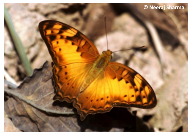
Image 1 Vagrant Vagrans egista

Remarks: On the sunny evening of 04 June 2018, an individual of Himalayan Yellow Coster was spotted