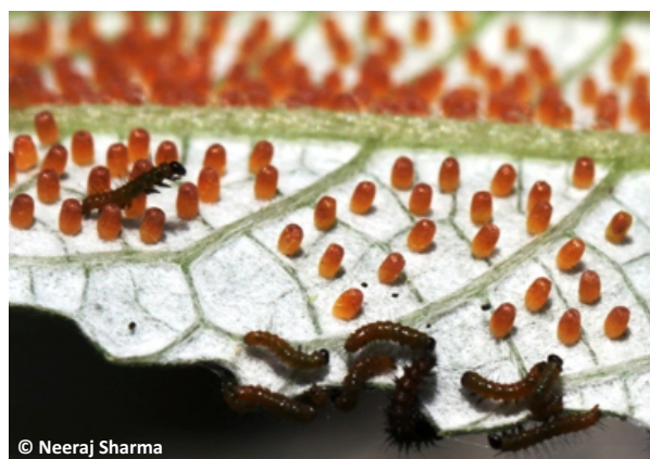
Image 2c. Himalayan Yellow Coster Acraea issoria issoria (eggs and caterpillars)