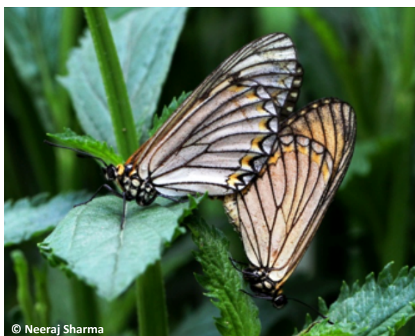
Image 2b. Himalayan Yellow Coster Acraea issoria issoria (mating pair)