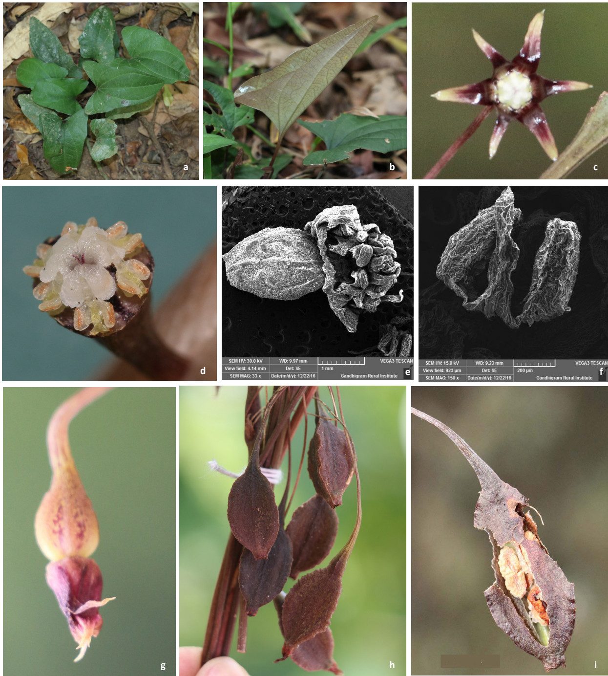
Image 1. Trichopus zeylanicus ssp. travancoricus : a - adult mature individual; b - leaf flushing; c - closer view of flower; d - closer view of Gynostemium; e - SEM view of Gynostemium; f - SEM view of anther; g - closer view of fertilized ovary; h - mature fruits; i - infected fruit.