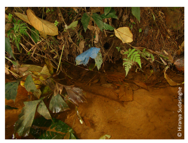
Image 2d. Habitat of P. titteya shown in Image 2c photographed in 2013