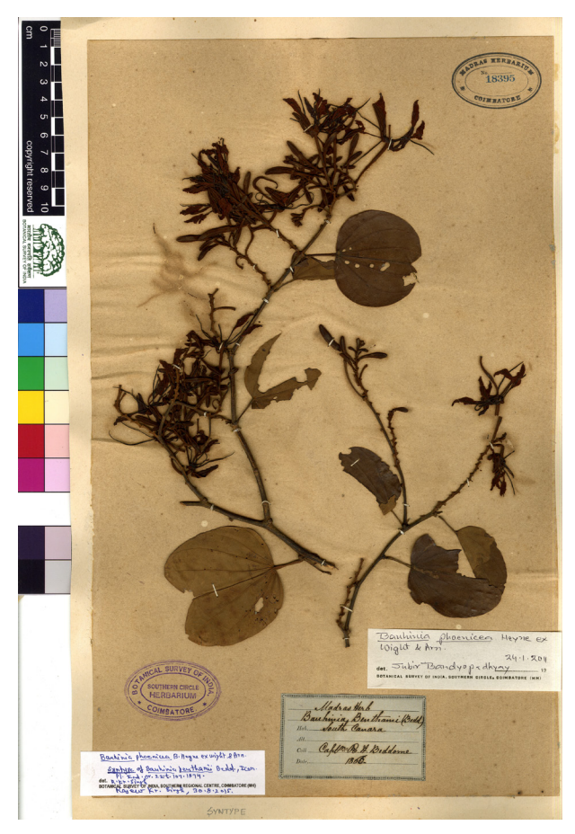
Image 9. Syntype of Bauhinia benthamii (Acc. no. 18395, © Botanical Survey of India, SRC, Coimbatore).

Education needed: Awareness programmes about the biological significance of this species to local people and forest department are