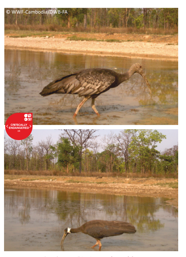
Image 4. Giant Ibis Thaumatibis gigantea (upper) foraging at modified waterhole #1 on 29 March 2012; and White-shouldered Ibis Pseudibis davisoni (lower) foraging at modified waterhole #1 on 20 March 2012.