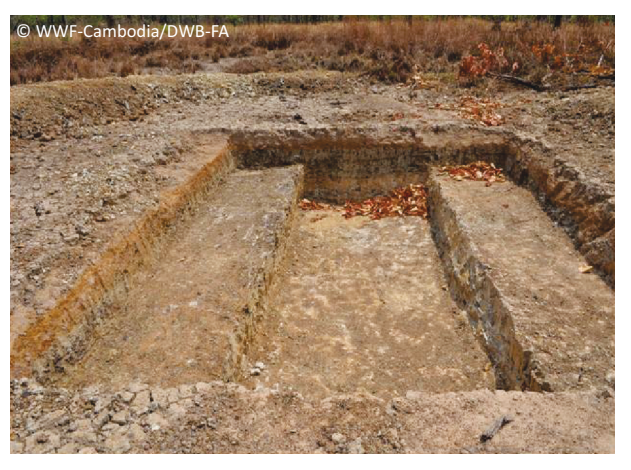
Image 1. Waterhole # 2 following artificial deepening (to depths of 50 and 100-cm; total earth excavated 18-m<sup>3</sup>) in April 2011.

approximately 20cm with a total of 3m^3 earth removed (Table 1).