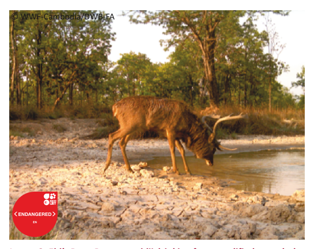
Image 2. Eld's Deer Rucervus eldii drinking from modified waterhole #2 on 18 March 2012