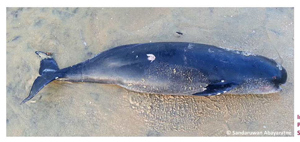
Image 1. Indo-Pacific Finless Porpoise specimen stranded in Sri Lanka

On 1 February 2014, a 120cm Indo-Pacific Finless Porpoise was washed ashore at Talaimannar at the western tip of Mannar Island (9.10750000 N & 79.73194444 E; Image 1). The specimen was measured and photographed. The external measurements were as follows: snout to centre of eye 6cm, snout to flipper 26.4cm, snout to umbilicus 68.4 cm, snout to genital slit 82cm, fluke width was 27cm. There were 18 teeth on