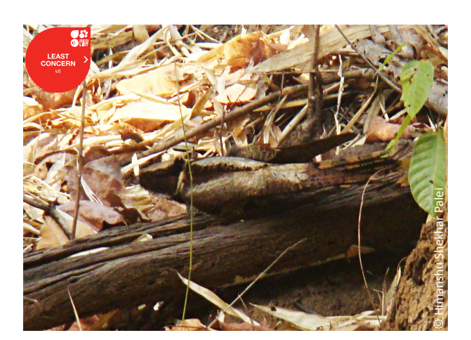
Image 1. Great Eared-Nightjar at Jakam in Karlapat Wildlife Sanctuary, Odisha, India