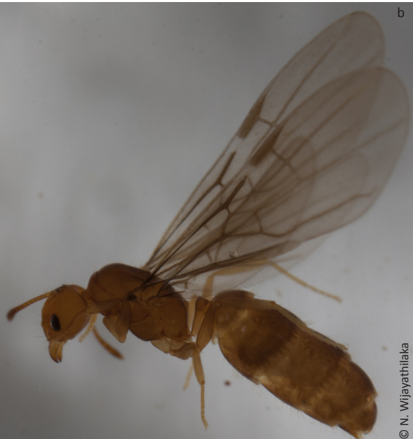
Image 1. Profile view of a worker (a) and a queen (b) of Aneuretus simoni.

Winkler extraction and hand collection. In six quadrats ants were hand collected for three hours by two people, while in the other six ants were extracted using the Mini-Winkler method (Bestelmeyer et al. 2000). Additionally, ants were collected randomly outside the transect using forceps. Collected ants were preserved in 70% alcohol and voucher specimens were deposited in Invertebrate Systematics and Diversity Facility at Department of Zoology, University of Peradeniya.