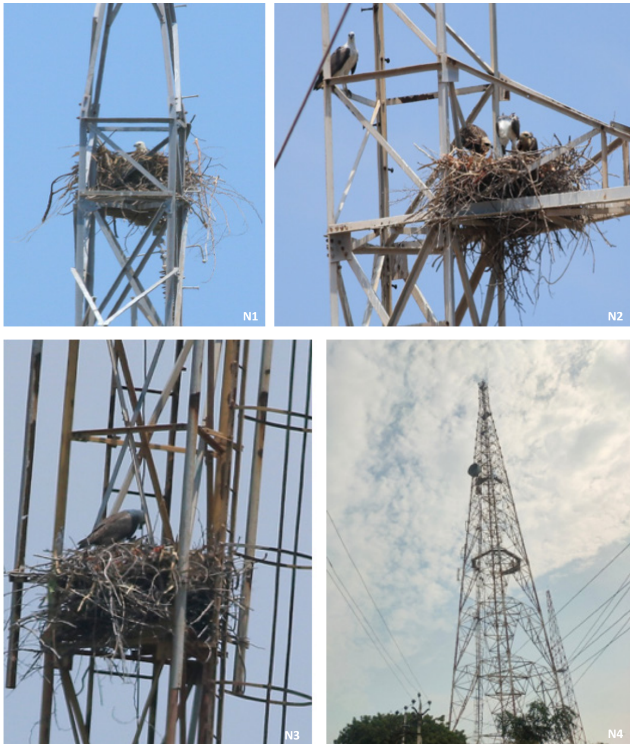
Image 1. White-bellied Sea Eagle Haliaeetus leucogaster : Nest 1 (N1)—adult in the nest | Nest 2 (N2)—parents with two chicks | Nest 3 (N3)—adult in nest | Nest 4 (N4)—abandoned nest.

installed. A promising strategy is the erection of purpose-built, safe artificial nest platforms (ANPs) on tall poles in secure locations near foraging areas. These ANPs can be designed to be more attractive (stable, spacious) and